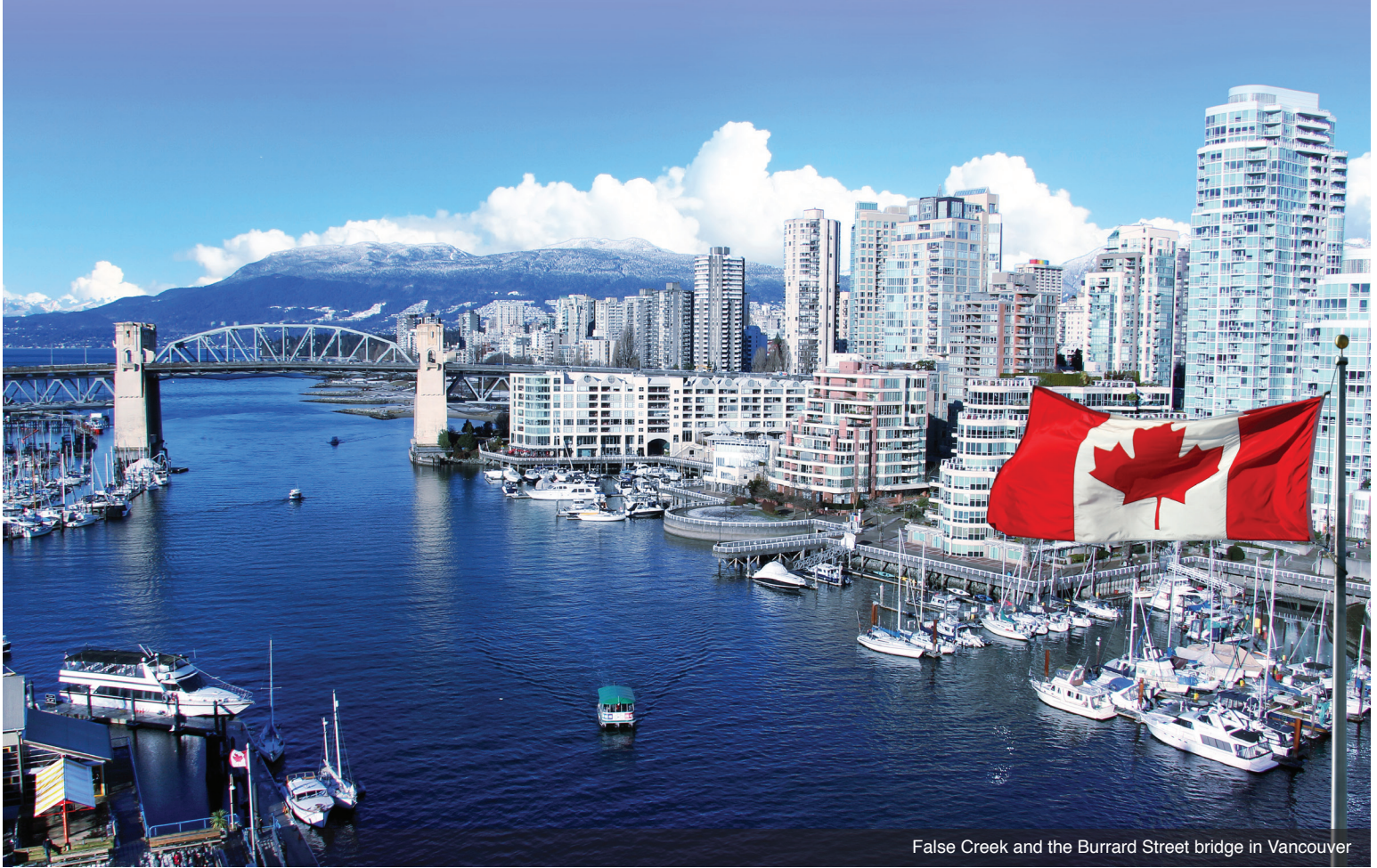
False Creek and the Burrard Street bridge in Vancouver