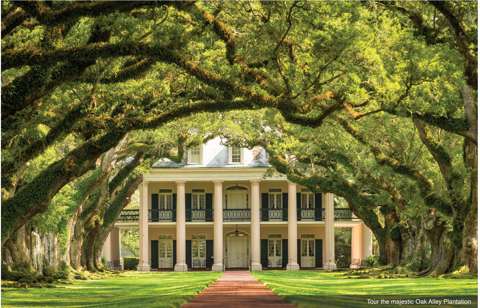
Tour the majestic Oak Alley Plantation