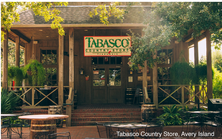
Tabasco Country Store, Avery Island

DAY 6 Travel Home: After breakfast, a group transfer to the New Orleans Airport is available for flights out after 12:00 p.m. Meal: B