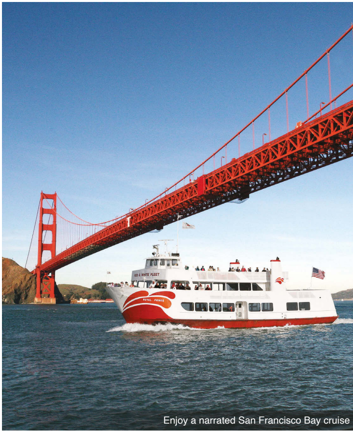
Enjoy a narrated San Francisco Bay cruise

has been expertly designed for you be the estate's Chef pairing your wine tastings with individual dinner courses. A fitting farewell dinner for your trip. Meals: B, D