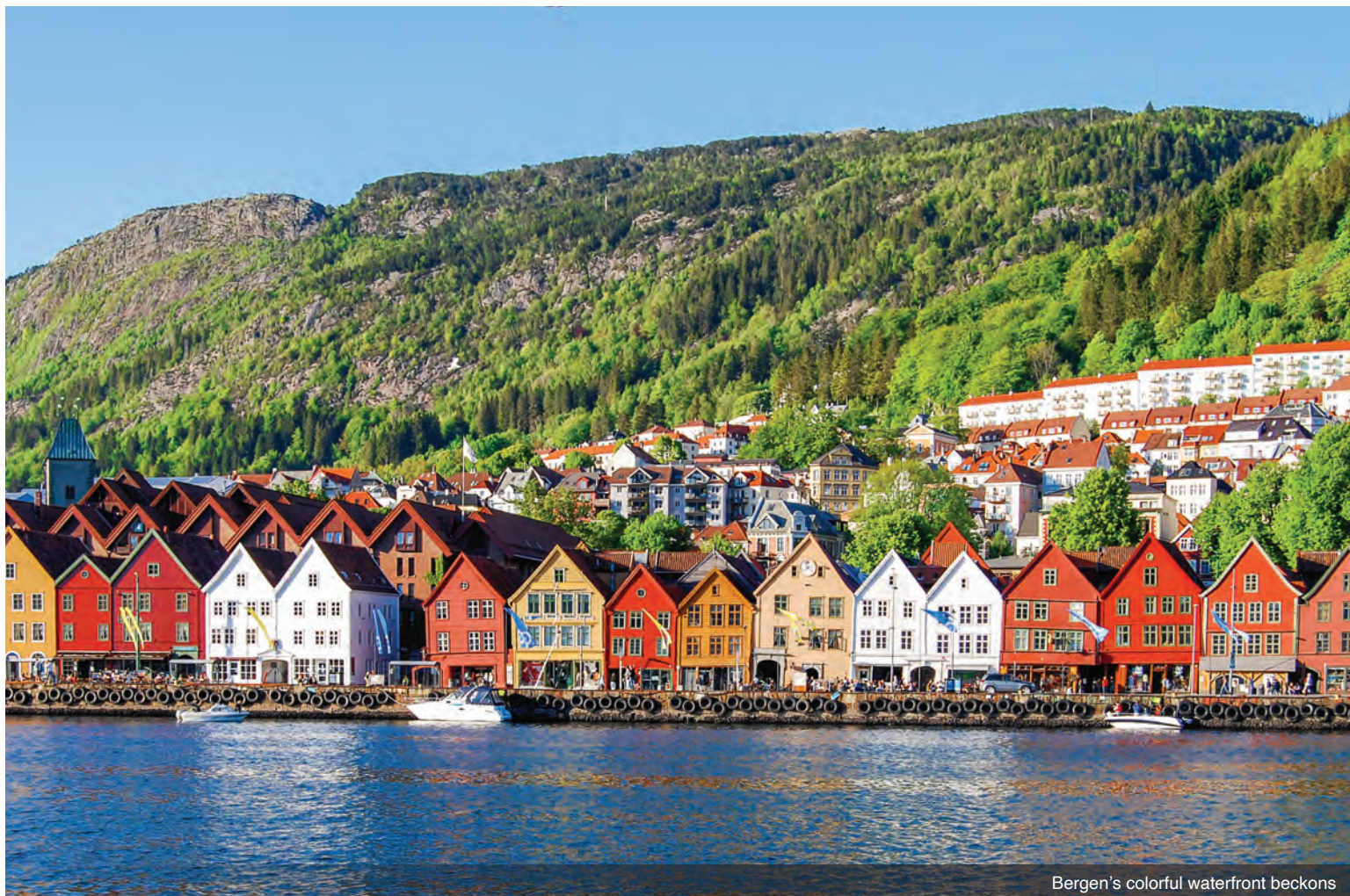
Bergen's colorful waterfront beckons