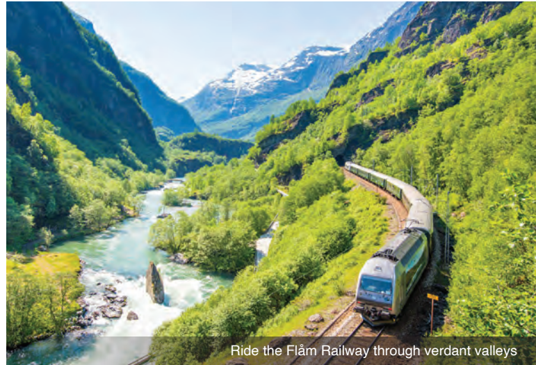
Ride the Flåm Railway through verdant valleys

DAY 1 Depart the USA: Today you'll depart the USA on your overnight flight to Stockholm, Sweden.