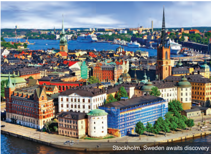
Stockholm, Sweden awaits discovery