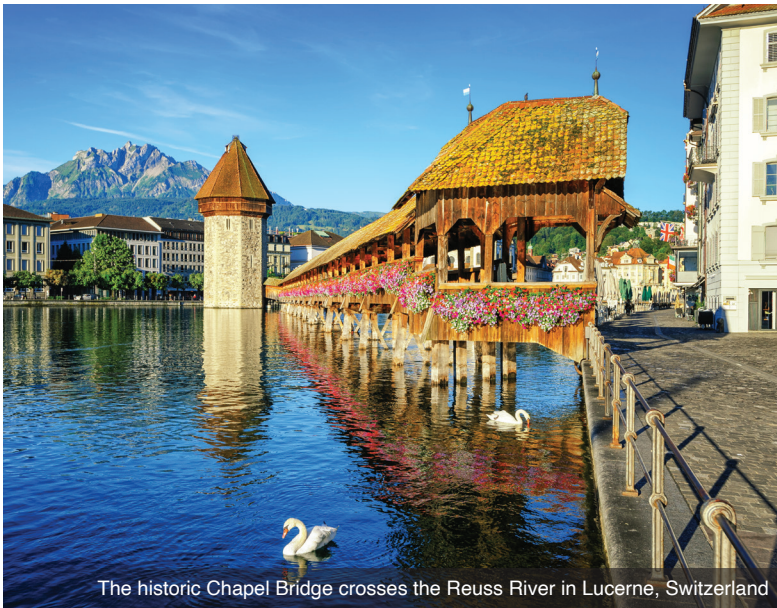
The historic Chapel Bridge crosses the Reuss River in Lucerne, Switzerland

DAY 9 Huningue, France – Lucerne, Switzerland: After breakfast, disembark the ship in Huningue and begin your Swiss adventure. Depart by coach to Lucerne, a picturesque town surrounded by mountains and meadows. An included walking tour highlights the city's landmark - the famous 14th-century Chapel Bridge. See the 17th-century Renaissance Town Hall and town squares, all set amongst the beautiful backdrop of the Swiss Alps. The remainder of the day is at leisure. Meal: B