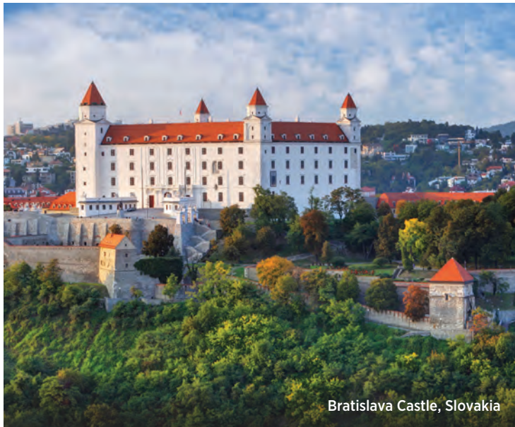
Bratislava Castle, Slovakia

most important Benedictine abbeys. Sitting atop a hill near Krems, this architectural treasure overlooks the spectacular Wachau Valley.