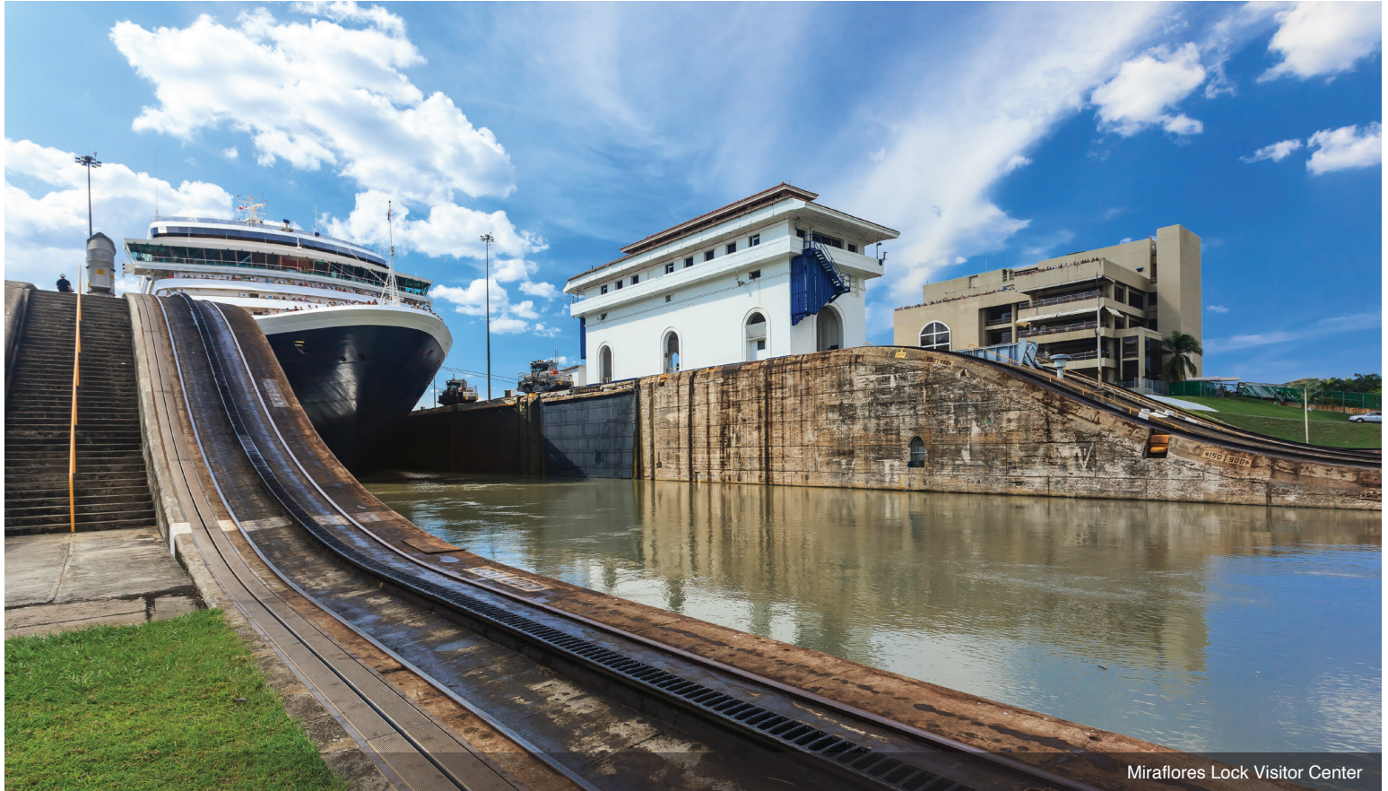
Miraflores Lock Visitor Center