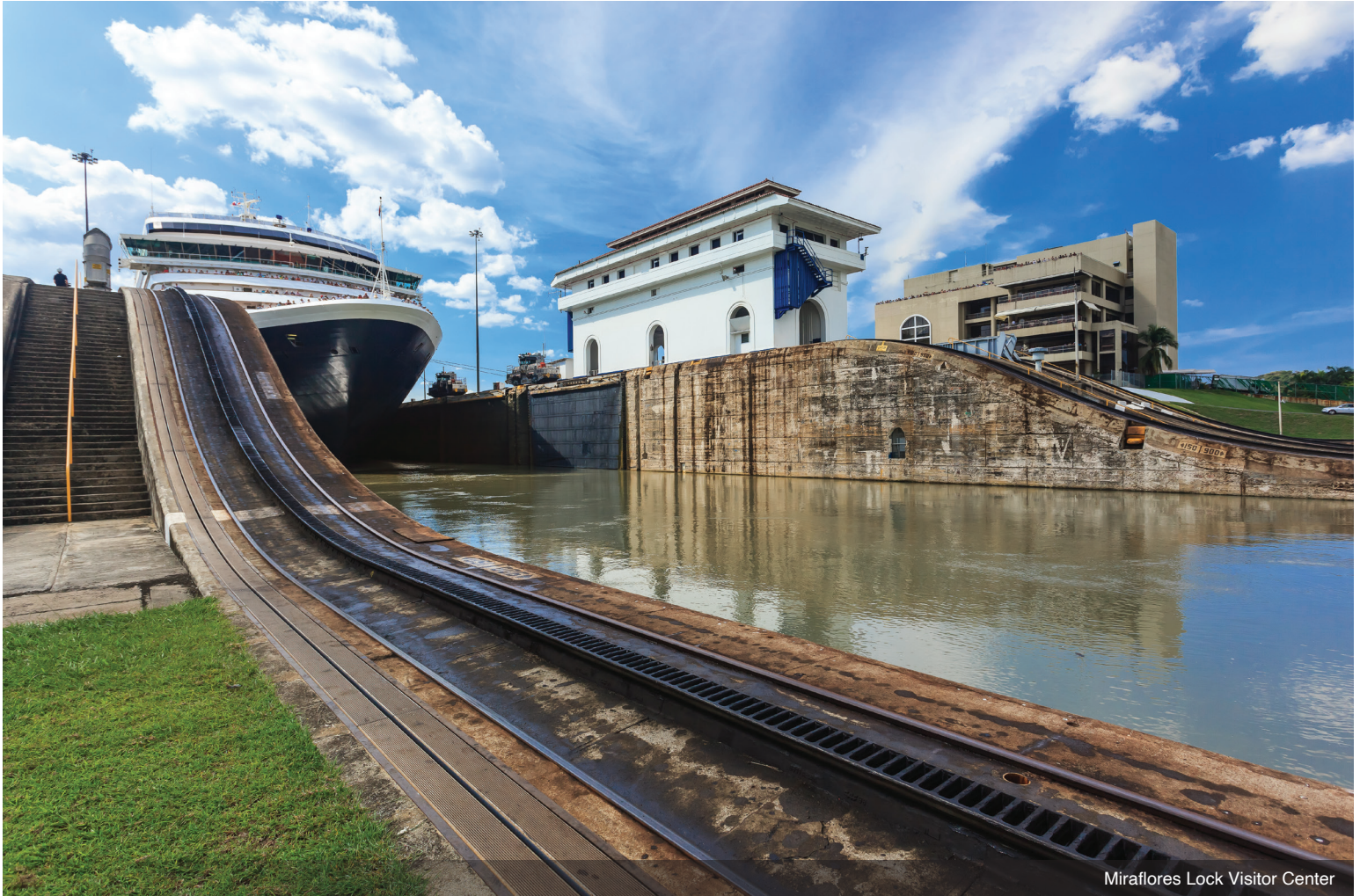
Miraflores Lock Visitor Center