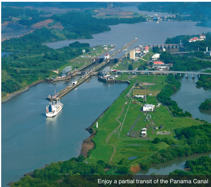
Enjoy a partial transit of the Panama Canal