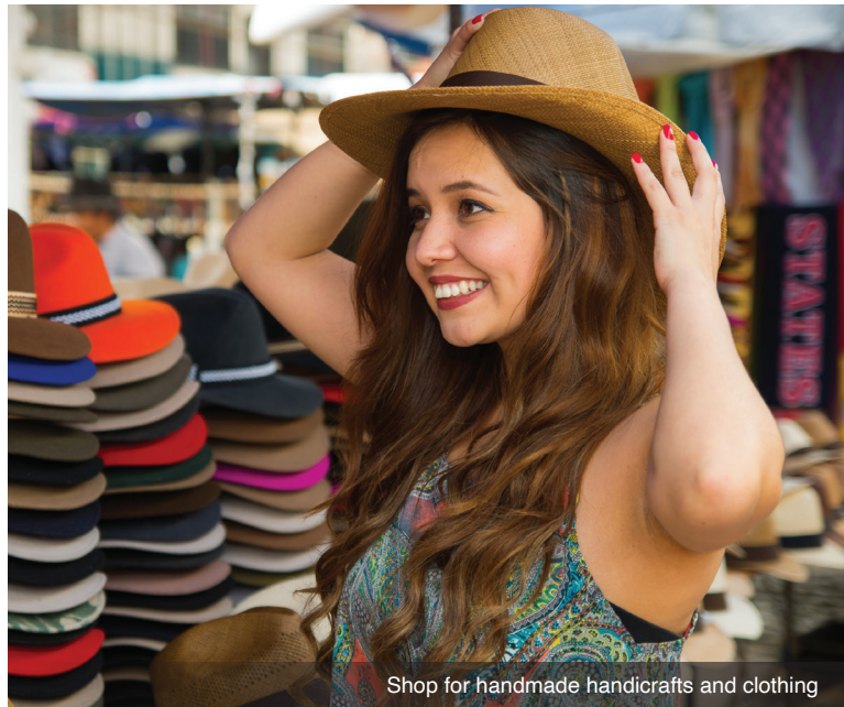
Shop for handmade handicrafts and clothing

DAY 1 USA / Panama City, Panama: Depart the USA on your flight to Panama City. After arrival, the remainder of the day is at leisure to become acquainted with your new surroundings.