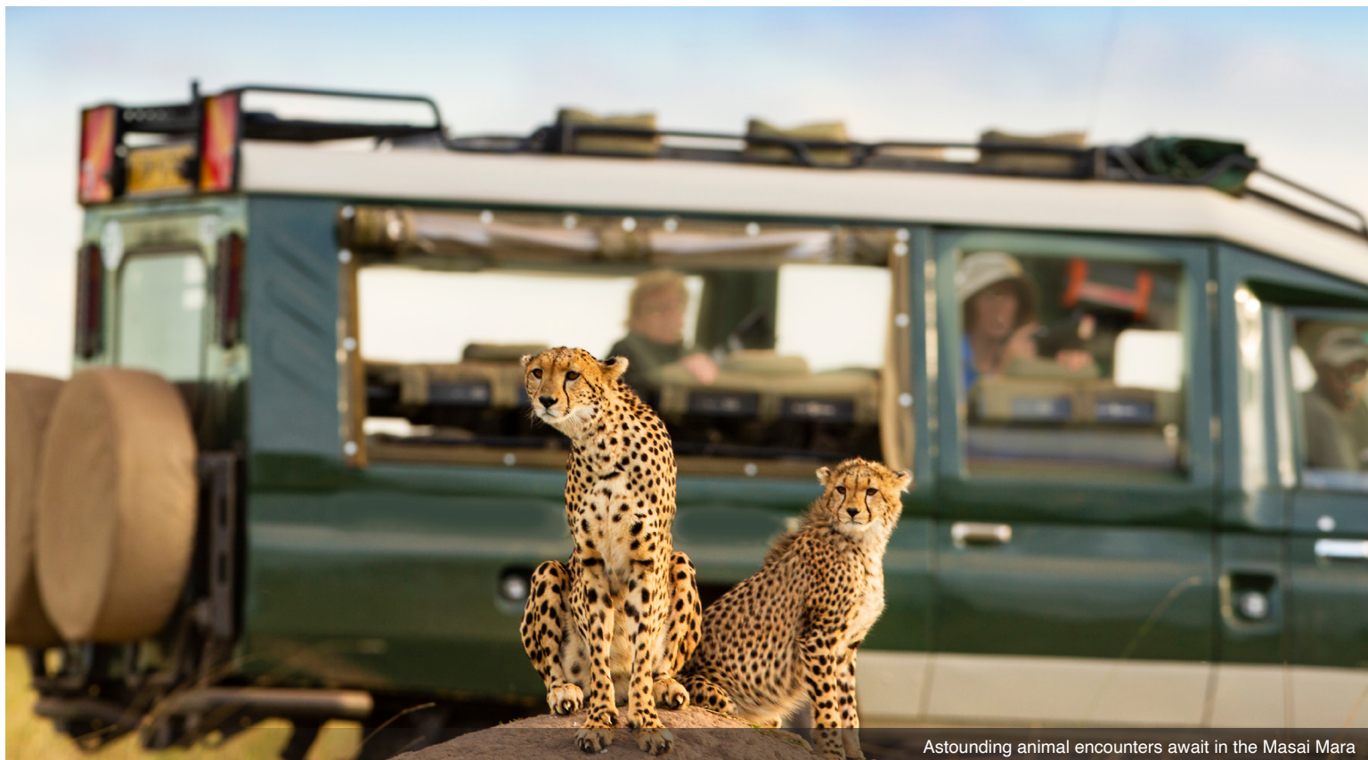
Astounding animal encounters await in the Masai Mara