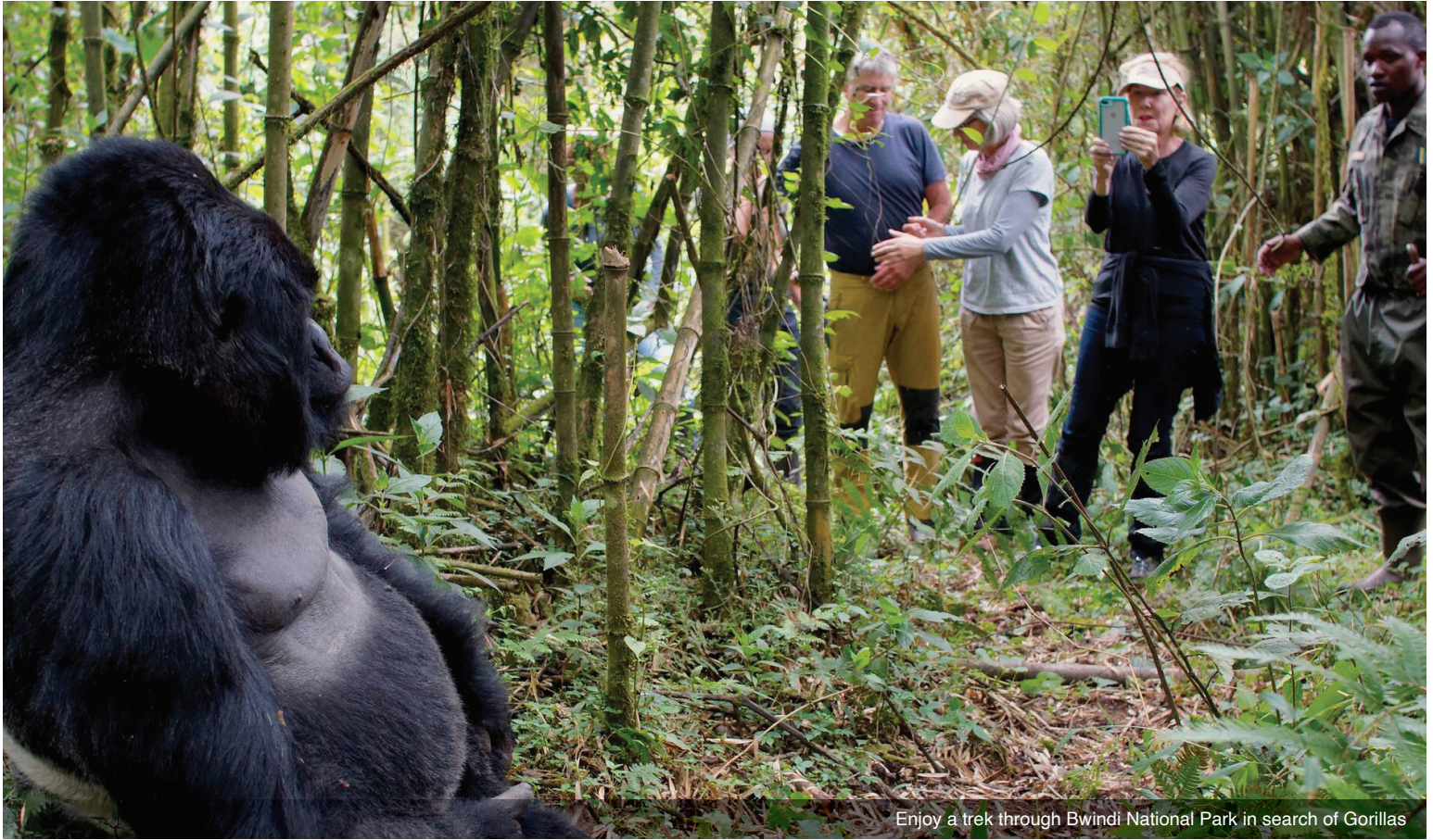
Enjoy a trek through Bwindi National Park in search of Gorillas