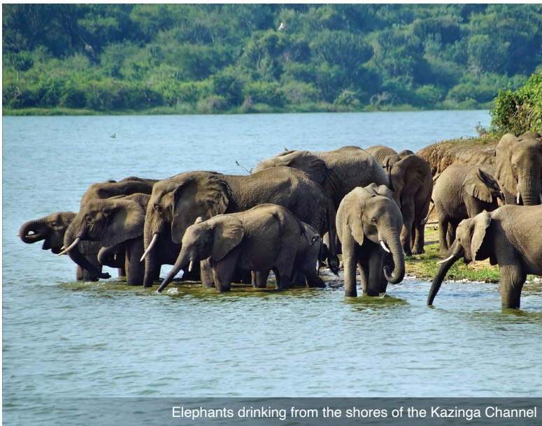
Elephants drinking from the shores of the Kazinga Channel

hyenas before they retreat into the woods to seek shelter from the sun. This afternoon, a different adventure is in store as you set sail on the Kazinga Channel, exploring the waterway known for its various bird species and hippo population. Elephants are often seen drinking from the shores, water buffalo bask in the mud, warthogs run along the shore and plenty of birds inhabit the trees. Spend the evening relaxing at the lodge or enjoy an early-evening game drive through the park. Meals: B, L, D