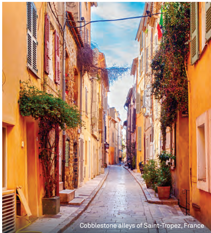
Cobblestone alleys of Saint-Tropez, France

The itinerary is a guide only and may be amended for operational reasons. As such Mayflower & Scenic cannot guarantee the tour will operate unaltered from the itinerary stated above. Please refer to our terms and conditions for further information.