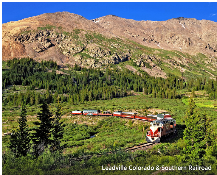
Leadville Colorado & Southern Railroad

Departing Denver, venture into Rocky Mountain National Park, a living showcase of the grandeur of the Rocky Mountains. With elevations ranging from 8,000 feet on the wet, grassy valleys to 14,259 feet at the weather-ravaged top of Longs Peak, the park is filled with breathtaking scenery and experiences. Following the Trail Ridge Road a stop at the Alpine Visitor Center offers an opportunity to learn more about this fascinating place. Meal: B