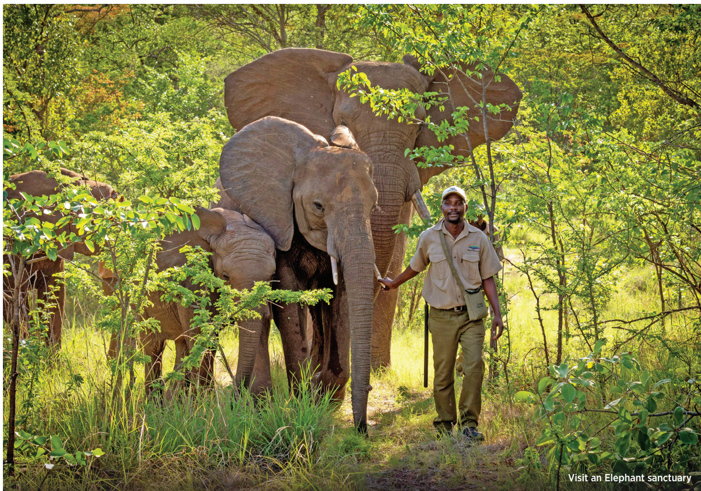
Visit an Elephant sanctuary