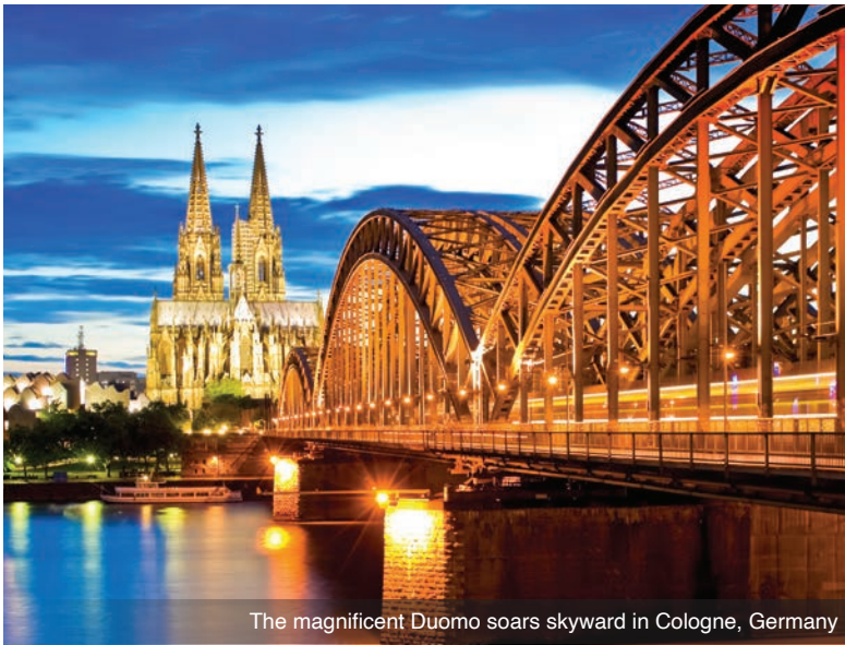
The magnificent Duomo soars skyward in Cologne, Germany

DAY 9 Cologne > Düsseldorf: This morning, you'll will arrive in Cologne and have the chance to know one of Germany's oldest cities and get up close with the famous post card worthy Cathedral. After lunch, join a walking tour of Düsseldorf, a vibrant city renowned for its stylish boutiques and charming Old Town. Stroll along the picturesque Rhine River, admire the stunning architecture and discover hidden gems off-the-beaten path. Immerse yourself in the city's lively atmosphere, indulge in the delicious local cuisine, and marvel at the contrast of Düsseldorf's ancient and modern charms.