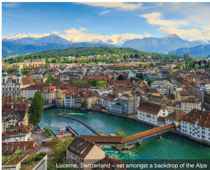
Lucerne, Switzerland – set amongst a backdrop of the Alps