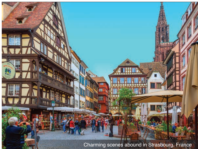
Charming scenes abound in Strasbourg, France

DAY 1 Depart the USA: Depart the USA on your overnight flight to Zurich, Switzerland.