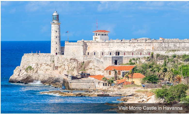
Visit Morro Castle in Havana

the heritage of Morro Castle. Next visit the neighborhood community project Muraleando, focusing on teaching skills to the younger generation. Meet with community artists and children who participate in visual arts, music and dance, hearing how these activities play an important role in changing their lives. See how a response to social hardship evolved into a thriving cultural center. Today's traditional lunch is prepared by members of the project Muraleando. While visiting a privately-run Cuban dance academy, talk with the professional instructors about the evolution of Cuban dance and learn the challenges of running private schools within Cuba's socio-economic landscape. Participate in a Salsa dance class to experience the local rhythm yourself! Dinner is at Al Carbón, a privately-run paladar in Old Havana, offering rustic elegance and wood-fired Cuban dishes. Learn about culinary innovation and entrepreneurship from the restaurant staff. Meals: B, L, D