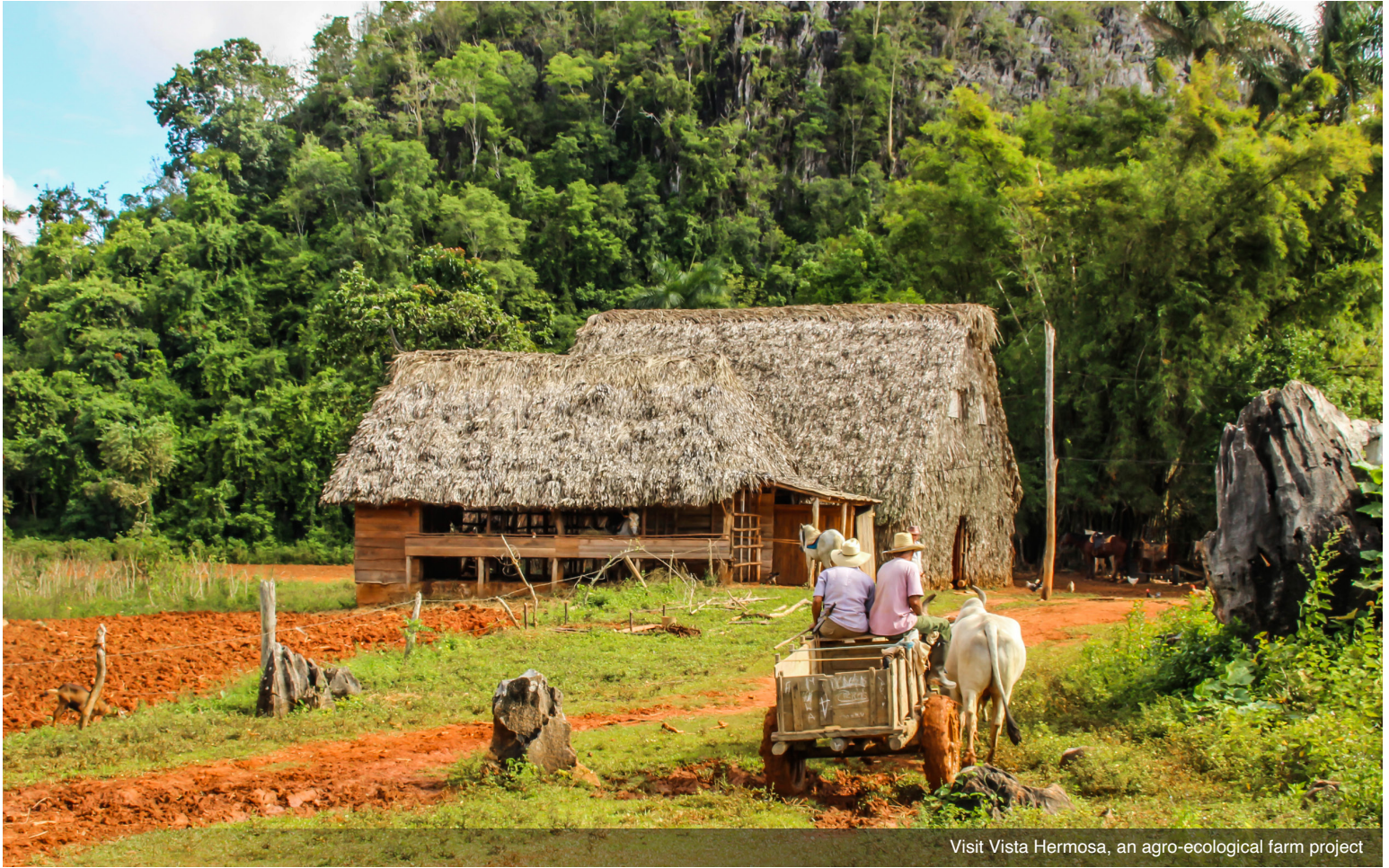
Visit Vista Hermosa, an agro-ecological farm project