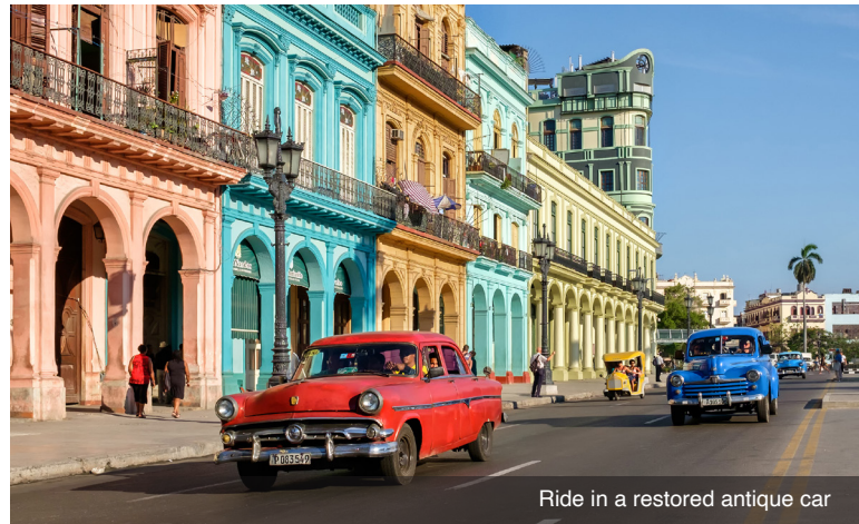
Ride in a restored antique car

DAY 2 Old Havana Immersion: During a walking excursion through the heart of Old Havana – a UNESCO World Heritage Site, discover the historic importance and architectural beauty of its four iconic plazas: Plaza de la Catedral, Plaza Vieja, Plaza de Armas and Plaza de San Francisco. Your local guide provides details of their significance to the city, while allowing time to engage with local residents, from vendors and artists to workers and community members, to gain firsthand insight into Cuban life today. Next, mix and mingle with the artisans and vendors of the San José Craft Market while discovering their entrepreneurial spirit and learning about their art. Stop by a privately-owned cigar shop to hear how this ancient art is kept alive, is a major contributor to the local economy, and see the craftsmanship involved in creating one of Cuba's most iconic products. Enjoy lunch at Chachacha, a privately-owned paladar, blending flavor and authenticity. This evening, hop into a vintage car for a panoramic ride through the streets of Havana. Travel in style in these restored antique cars while driving along the Malecon (coastal road and seawall), see the 18th-century University (oldest in the Caribbean), the