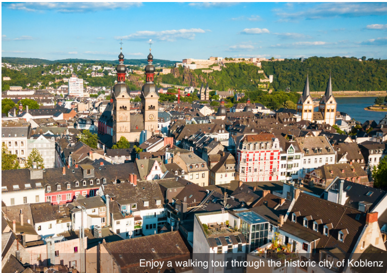
Enjoy a walking tour through the historic city of Koblenz

invitation for every history and culture enthusiast to appreciate one of the highest hill castles along the Moselle River. Meals: B, L, D