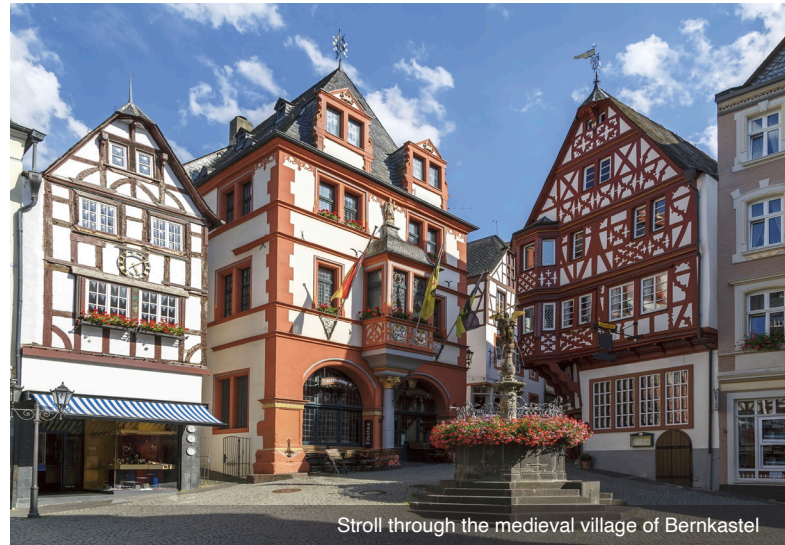
Stroll through the medieval village of Bernkastel

DAY 1 Depart the USA: Depart the USA on your overnight flight to Berlin, Germany.