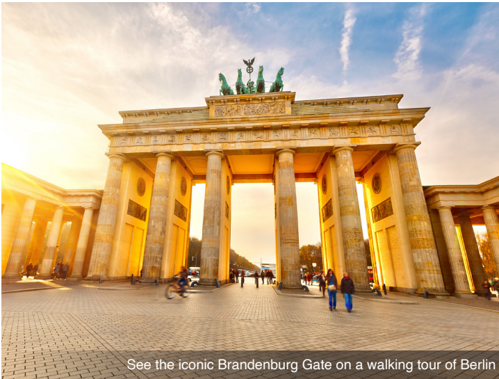
See the iconic Brandenburg Gate on a walking tour of Berlin