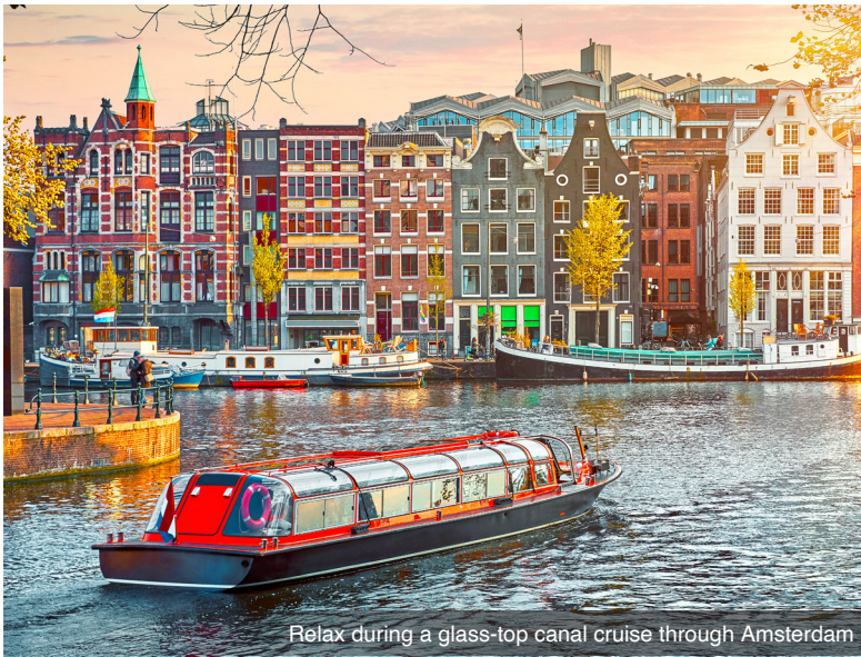
Relax during a glass-top canal cruise through Amsterdam

DAY 10 Koblenz: Begin the day sailing through the spectacular UNESCO World Heritage Rhine Gorge. Pass countless medieval castles and vineyards lining the shores of this section of the river, with photo opportunities around every bend. See the infamous Lorelei statue and Pfalzgrafenstein Castle, built on an island in the middle of the river as a medieval toll station. Continue cruising to the 2000-year-old town of Koblenz, situated at the confluence of the Rhine and Moselle Rivers. Enjoy a walking tour through the streets of the city as your guide points out historic monuments and buildings. See the 'German Corner' monument marking the confluence of the Rhine and Moselle Rivers. Panoramic views await from the visit to Ehrenbreitstein Fortress, reached by cable car, crossing the river! This evening, attend a private concert as part of the EmeraldPLUS program. Meals: B, L, D