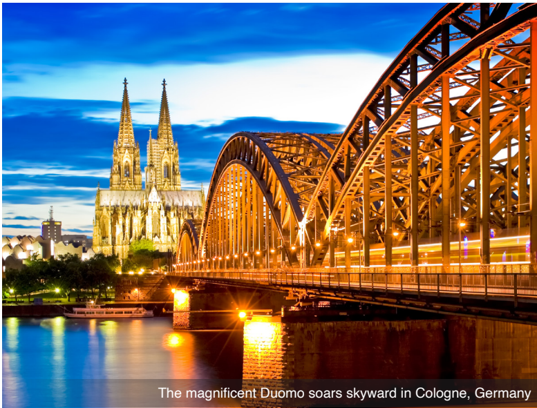
The magnificent Duomo soars skyward in Cologne, Germany

DAY 9 Cologne > Düsseldorf: This morning, you'll will arrive in Cologne and have the chance to know one of Germany's oldest cities and get up close with the famous post card worthy Cathedral. After lunch, join a walking tour of Düsseldorf, a vibrant city renowned for its stylish boutiques and charming Old Town. Stroll along the picturesque Rhine River, admire the stunning architecture and discover hidden gems off-the-beaten path. Immerse yourself in the city's lively atmosphere, indulge in the delicious local cuisine, and marvel at the contrast of Düsseldorf's ancient and modern charms.