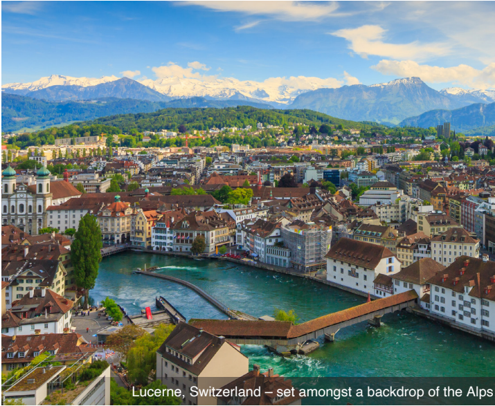
Lucerne, Switzerland – set amongst a backdrop of the Alps