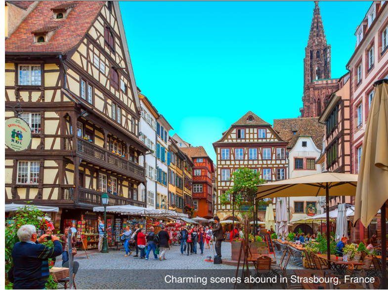
Charming scenes abound in Strasbourg, France

DAY 1 Depart the USA: Depart the USA on your overnight flight to Zurich, Switzerland.