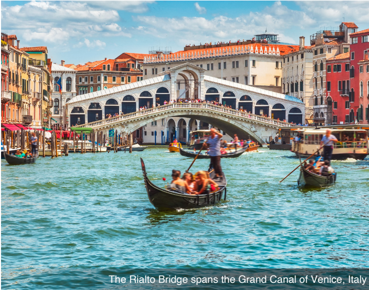
The Rialto Bridge spans the Grand Canal of Venice, Italy