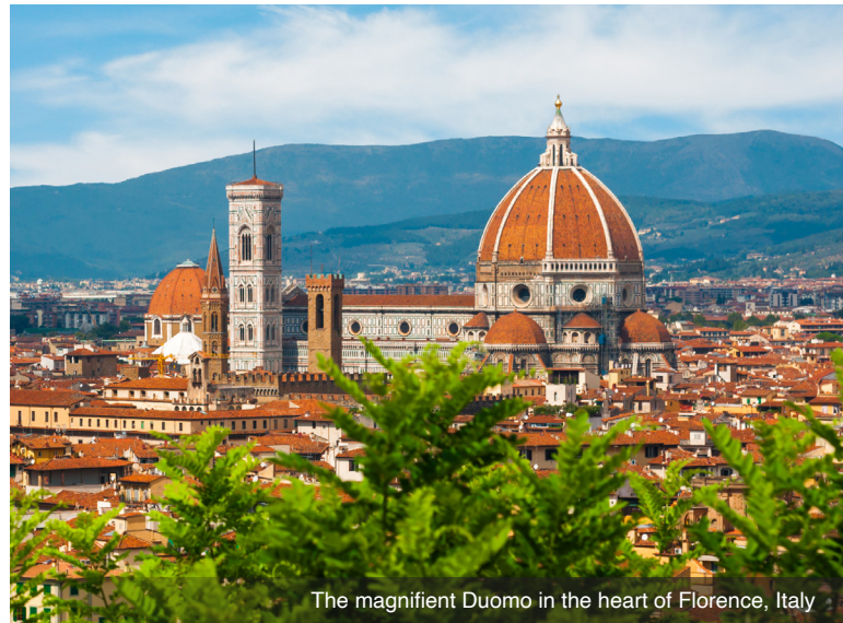
The magnificent Duomo in the heart of Florence, Italy

DAY 1 Depart the USA: Depart the USA on your overnight flight to Venice, Italy.