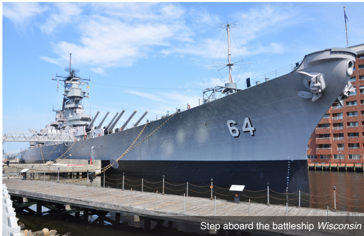
Step aboard the battleship Wisconsin

Numerous food trucks will be available for you to have lunch. Then, explore the history and significance of Fort Monroe, a National Historic Landmark, whose history spans 400 years. Later, visit the Virginia Air and Space Center whose permanent collection spans 100 years of flight, featured over 30 historic aircraft and the Apollo 12 Command Module. Meals: B, D