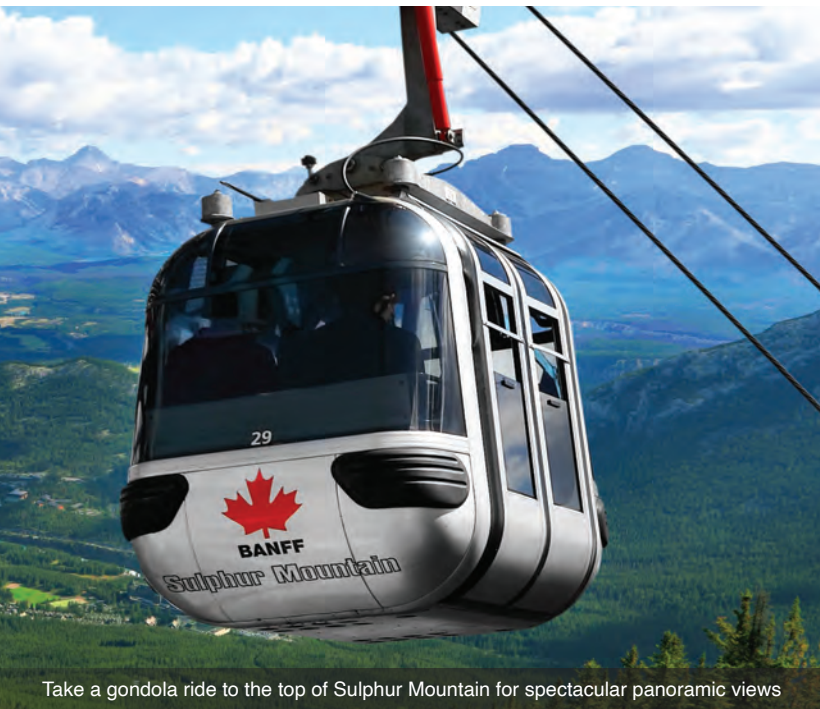
Take a gondola ride to the top of Sulphur Mountain for spectacular panoramic views

DAY 7 Museum of Anthropology, Granville Island and Gulf of Georgia Cannery: Begin the day at the Museum of Anthropology renowned for its world arts and cultures and works by the First Nation bands. Spend time at Granville Island’s public market, the crown jewel of the island. This outdoor market features colourful food, produce stores, handcrafted products and unique gifts. Later visit the Gulf of Georgia Cannery. Built in 1894 this National Historic Site echoes the days of when British Columbia was a leading salmon producer. Meals: B, D