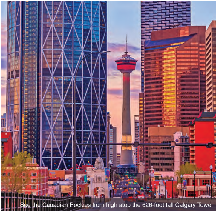
See the Canadian Rockies from high atop the 626-foot tall Calgary Tower