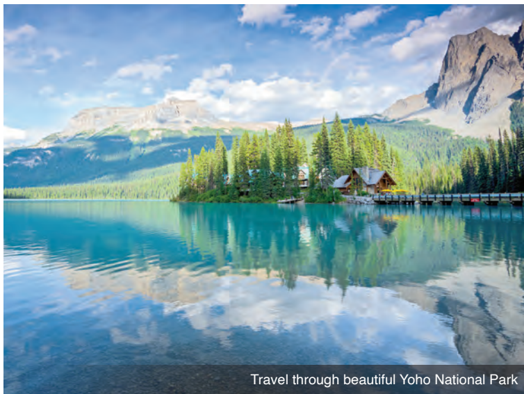
Travel through beautiful Yoho National Park

DAY 8 Return Home: Following breakfast, depart with a group transfer to the Vancouver International Airport for flights out after 12:00 p.m. Meal: B