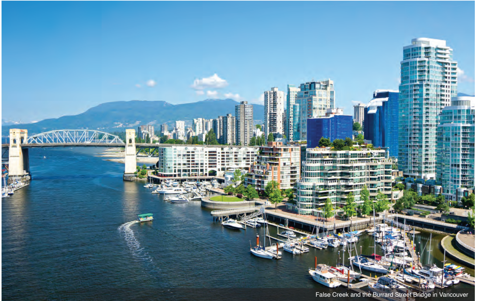
False Creek and the Burrard Street Bridge in Vancouver