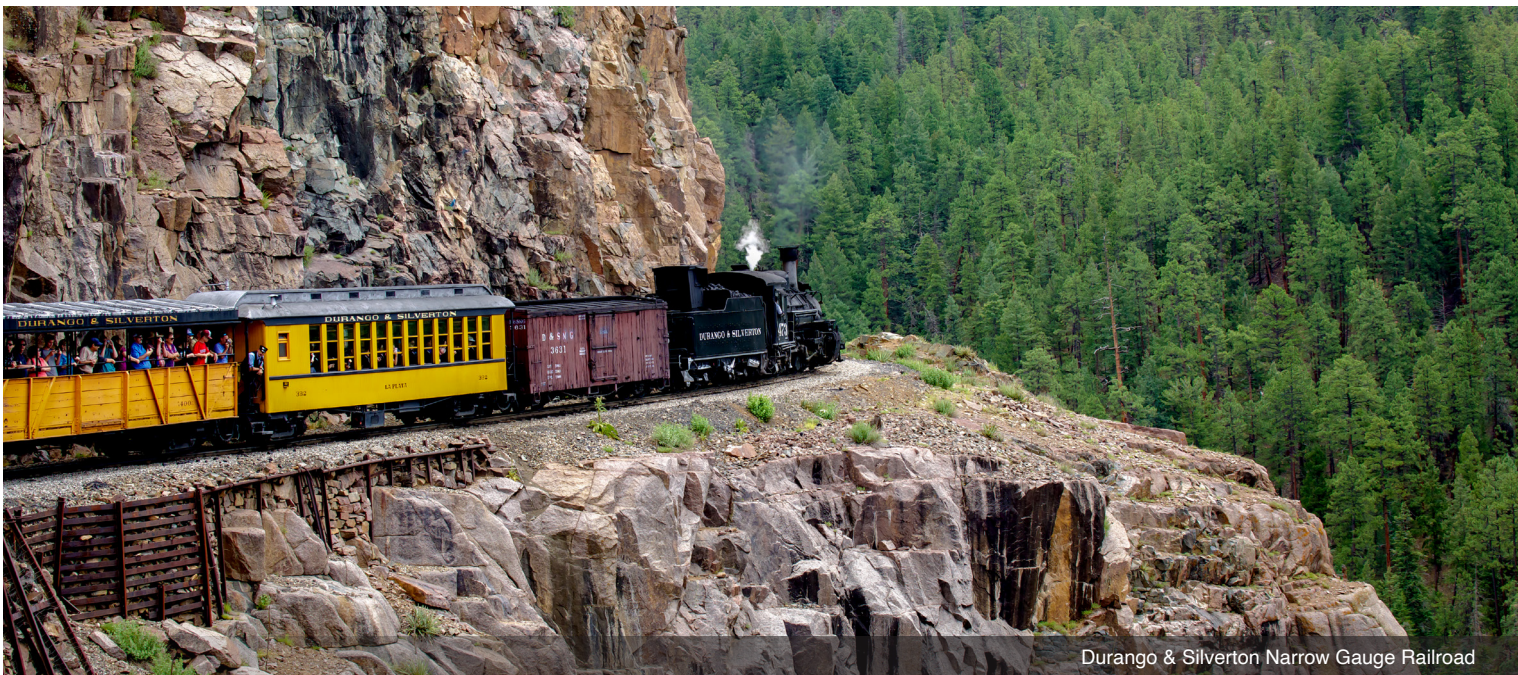
Durango & Silverton Narrow Gauge Railroad

DAY 6 Cumbres & Toltec Scenic Railroad: Your day begins as you board the motorcoach and ride to the Cumbres & Toltec Scenic Railroad, the original Rio Grande Line. This is America's most spectacular narrow gauge steam railroad. Explore 50 miles of wild and rugged territory between Chama, New Mexico and Antonito, Colorado, the highest point on the railroad. Meals: B, L