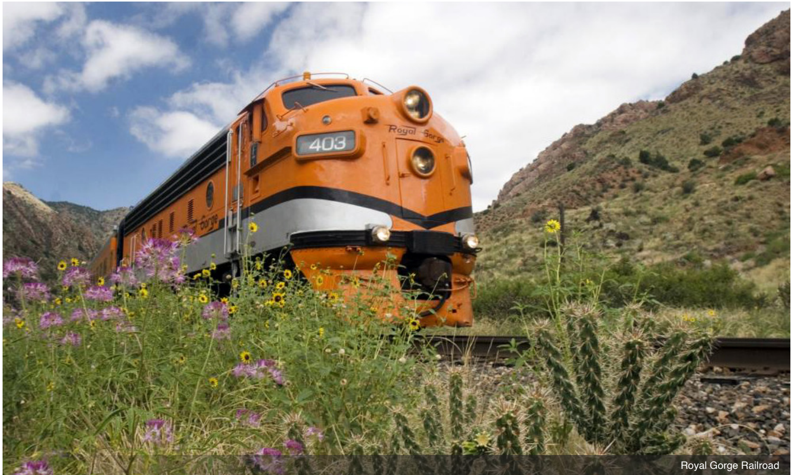
Royal Gorge Railroad