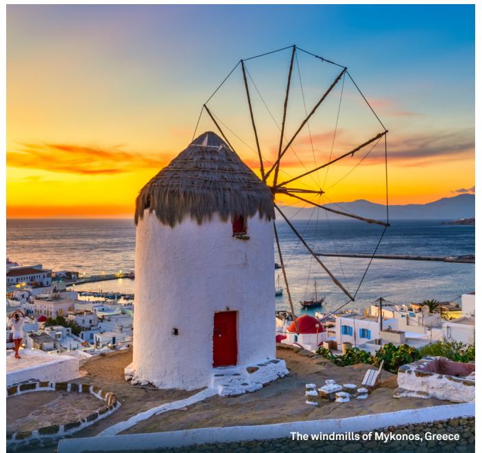
The windmills of Mykonos, Greece

The itinerary is a guide only and may be amended for operational reasons. As such Mayflower & Scenic cannot guarantee the tour will operate unaltered from the itinerary stated above. Please refer to our terms and conditions for further information.