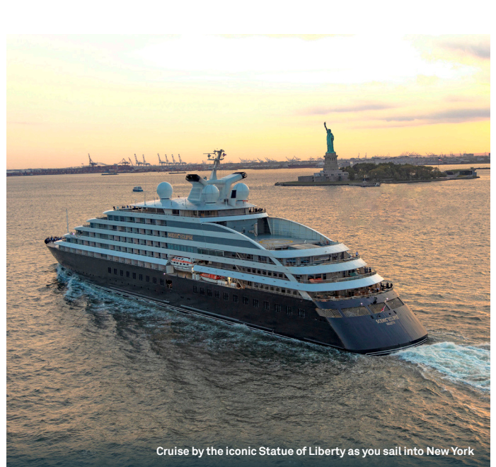
Cruise by the iconic Statue of Liberty as you sail into New York

Cruise past the iconic Statue of Liberty and the breathtaking Manhattan skyline as you cruise into New