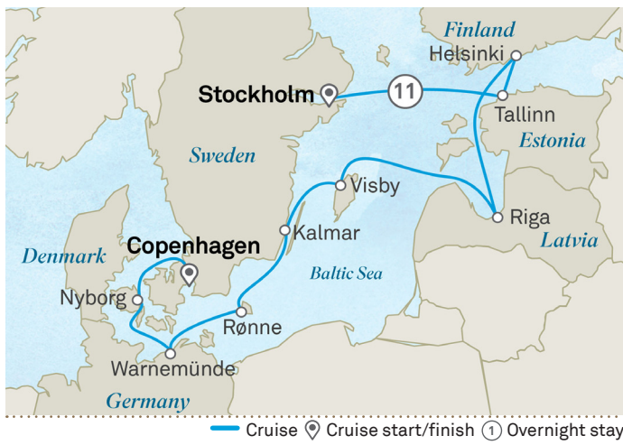
— Cruise ◉ Cruise start/finish ① Overnight stay

Relax and indulge in the serenity of a day at sea on board Scenic Eclipse II. Start with a yoga class in the PURE studio, swim in the temperature-controlled Vitality Pools, treat yourself to a massage at the Senses Spa or simply graze the day away at the Azure Bar & Caf e, surrounded by newfound friends. Tonight, you'll arrive in Riga, known as 'The Heart of Baltics'. You may choose to go ashore tonight for drinks at one of the stylish bars that line the waterfront or watch the city lights sparkle from the Sky Deck. Meals: B. L. D.