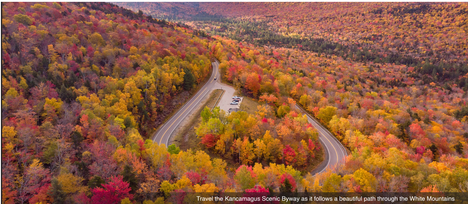
Travel the Kancamagus Scenic Byway as it follows a beautiful path through the White Mountains

such as Harwich with its miles of sandy beaches and lush cranberry bogs, Orleans with the natural beauty of its forests and the summer vacation community of Truro. Enjoy lunch in Provincetown, a once bustling whaling town with a connection to Pilgrim and American history. Meals: B, L