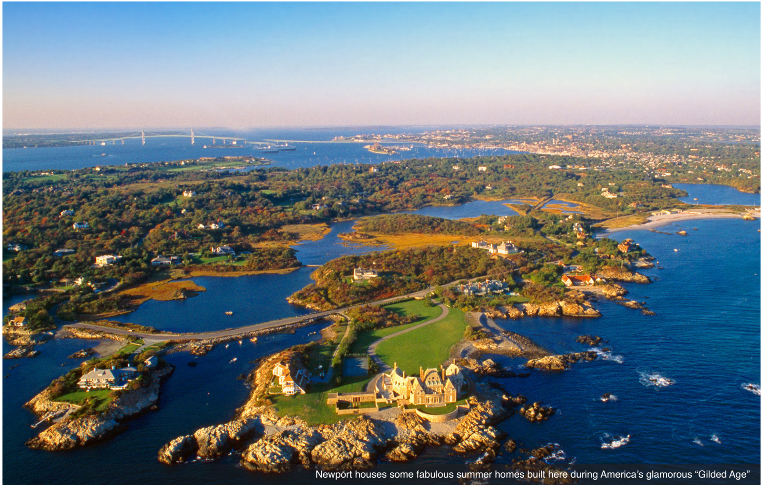
Newport houses some fabulous summer homes built here during America's glamorous "Gilded Age"