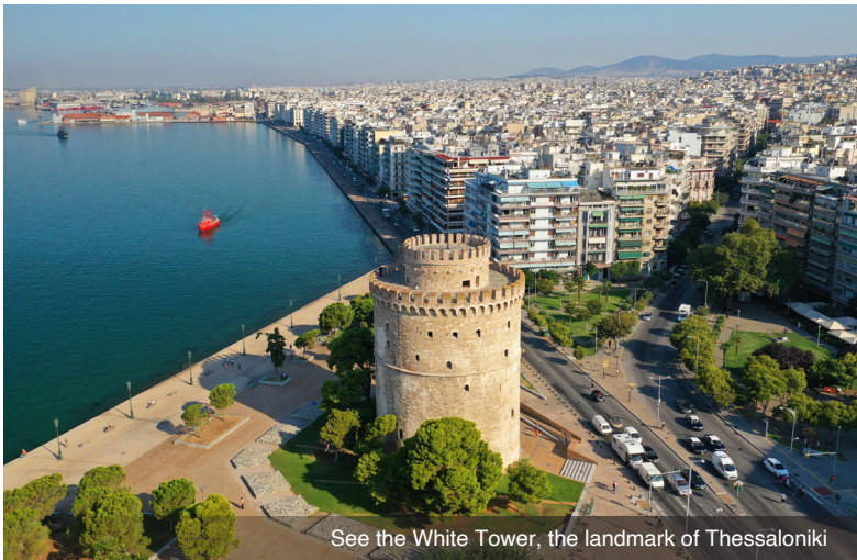
See the White Tower, the landmark of Thessaloniki

DAY 9 Delphi – Meteora – Thessaloniki: Journey to Thessaloniki, the second-largest city in Greece. Enroute, visit the breathtaking monasteries of Meteora, a UNESCO World Heritage Site. Perched on huge rock formations, they seem suspended between the earth and sky, creating a unique, surreal landscape and the perfect place to find spiritual peace. Of the initial twenty-four monasteries, only 6 remain active today. During the visit to 2 of these, priceless historical and religious treasures will be found inside. After the mystical visit to Meteora, continue to Thessaloniki and check in to the hotel. Meal: B