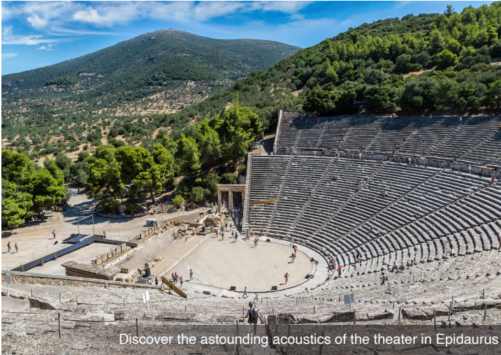
Discover the astounding acoustics of the theater in Epidaurus