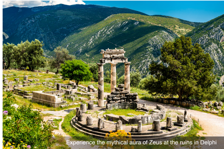
Experience the mythical aura of Zeus at the ruins in Delphi

DAY 1 Depart the USA: Depart the USA on your overnight flight to Athens, Greece.