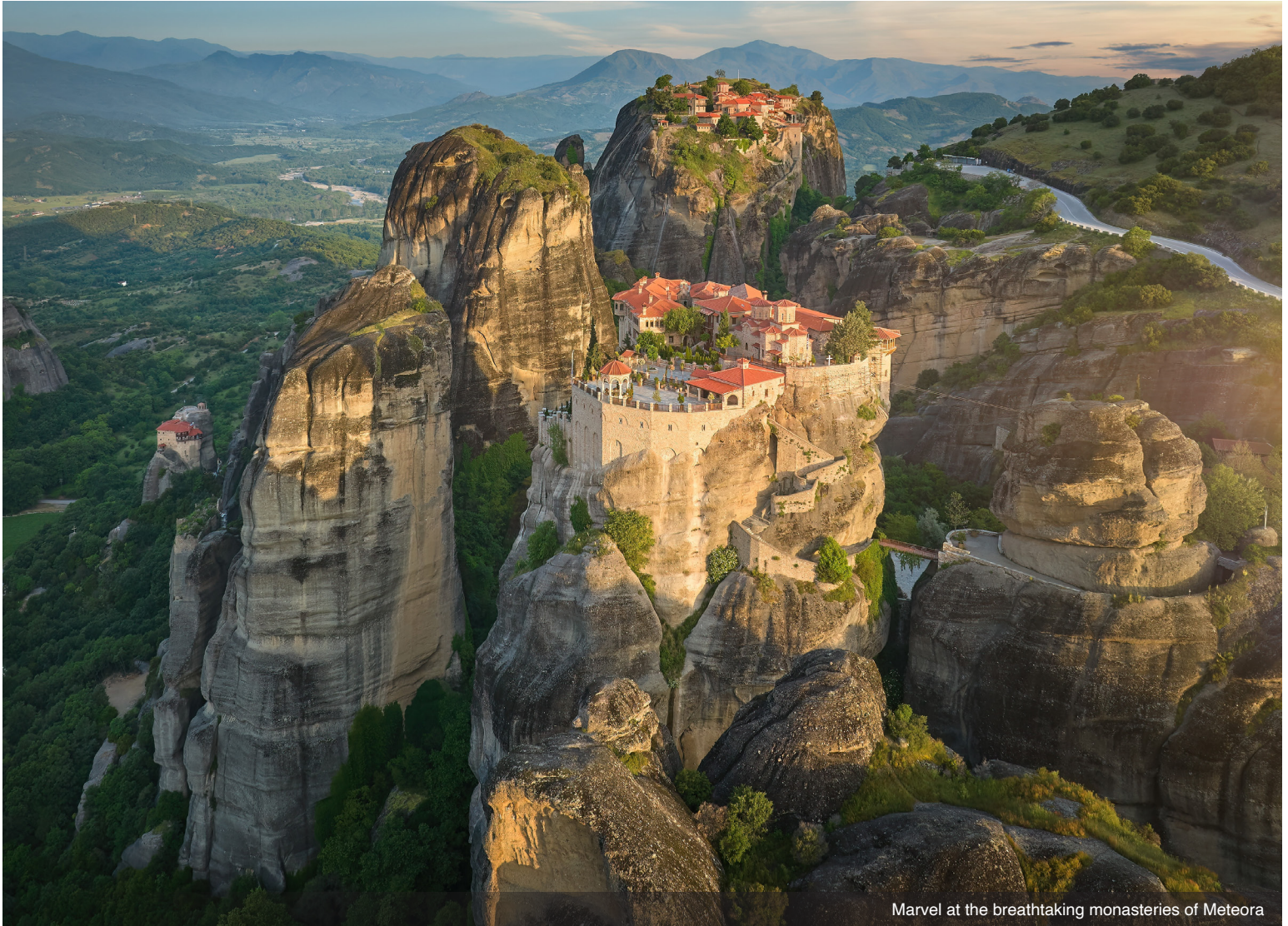
Marvel at the breathtaking monasteries of Meteora