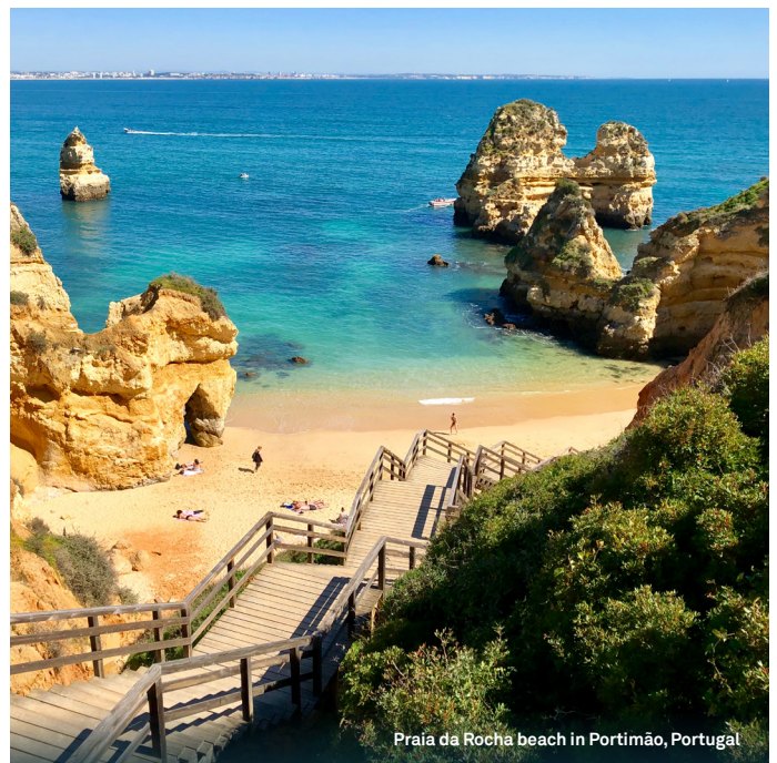
Praia da Rocha beach in Portimão, Portugal

The itinerary is a guide only and may be amended for operational reasons. As such Mayflower & Scenic cannot guarantee the tour will operate unaltered from the itinerary stated above. Please refer to our terms and conditions for further information.