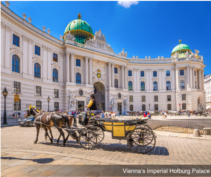
Vienna's Imperial Hofburg Palace