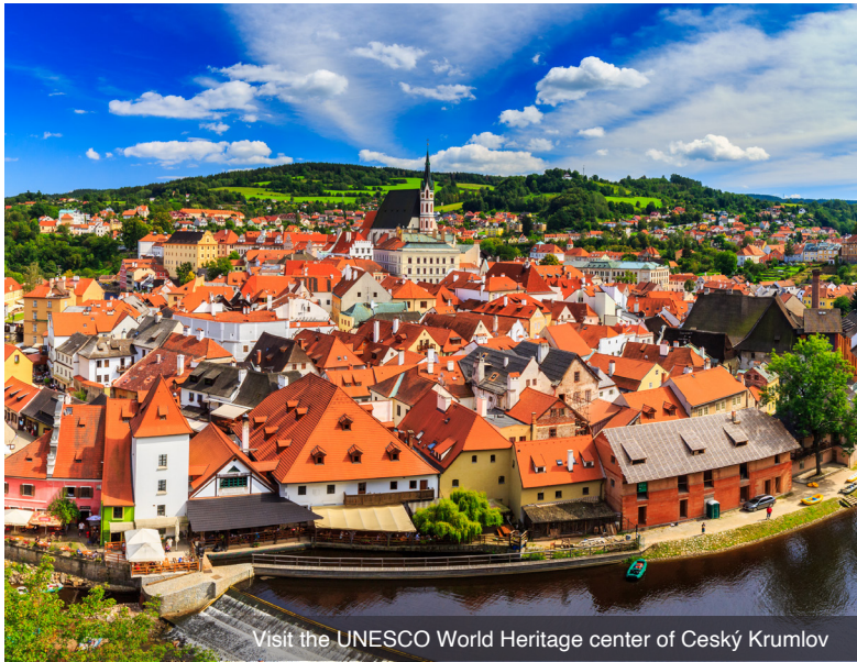
Visit the UNESCO World Heritage center of Český Krumlov

After the included visit to Melk Abbey, choose to join the optional excursion to Schallaburg Castle or enjoy free time in Melk.