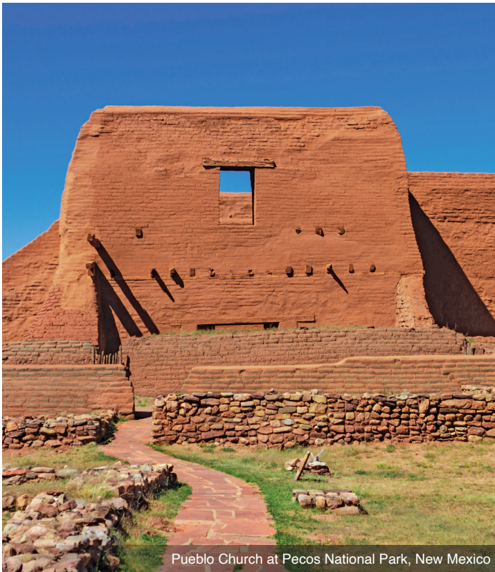
Pueblo Church at Pecos National Park, New Mexico

Then, a local Guide conducts a walking tour of historic Santa Fe. Visit the Loretto Chapel, whose staircase is a marvel of architectural ingenuity. Meal: B