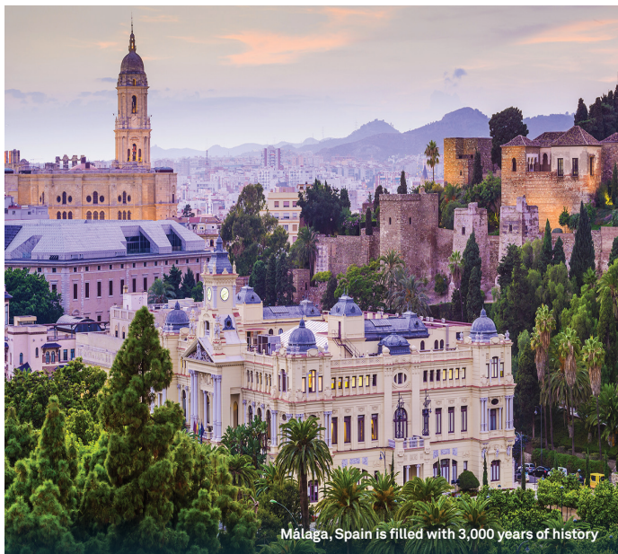
Málaga, Spain is filled with 3,000 years of history