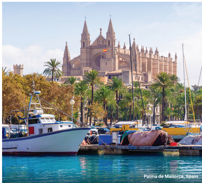
Palma de Mallorca, Spain

villages of the area as well as a stylish port town with sophistication and elegance. You'll sail this afternoon for the ancient city of Málaga on the famous Costa del Sol. Go ashore this evening to uncover local gastronomic delights such as 'tinto de verano', a delicious, iced summer wine. Meals: B. L. D.