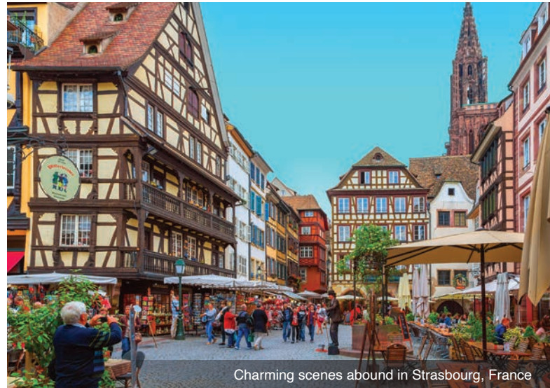
Charming scenes abound in Strasbourg, France

DAY 1 Depart the USA: Today you'll depart the USA on your overnight flight to Zurich, Switzerland.