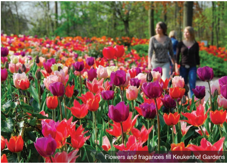
Flowers and fragrances fill Keukenhof Gardens

where the 2 rivers meet and the Church of Our Lady.