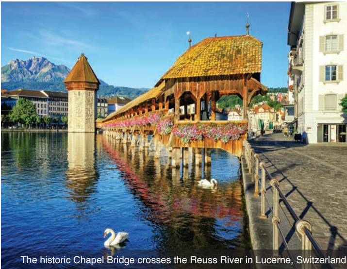
The historic Chapel Bridge crosses the Reuss River in Lucerne, Switzerland