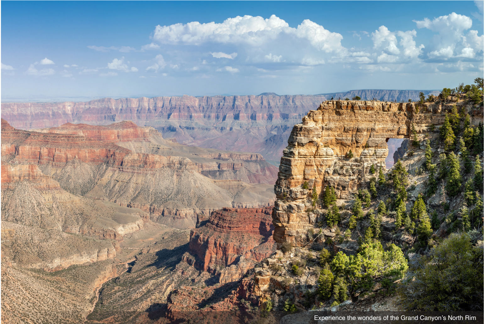
Experience the wonders of the Grand Canyon's North Rim