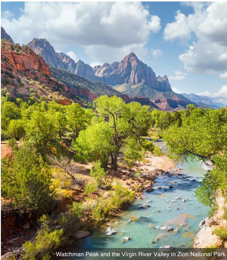
Watchman Peak and the Virgin River Valley in Zion National Park

have been formed by frost weathering and stream erosion of the river and lake bed sedimentary rocks. Meals: B, D