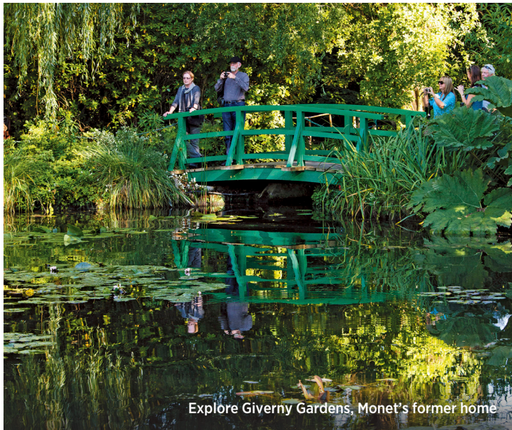
Explore Giverny Gardens, Monet's former home

landed, as well as the memorials and museum, which honor the bravery of those involved and their ultimate sacrifice. Your Star-Ship remains docked in Honfleur overnight. Meals: B, L, D