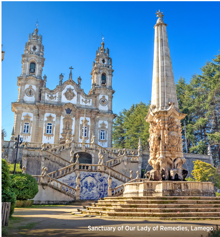
Sanctuary of Our Lady of Remedies, Lamego

Return to the ship for lunch and relax on deck as the ship sails through idyllic surroundings on the way to Régua. Meals: B, L, D