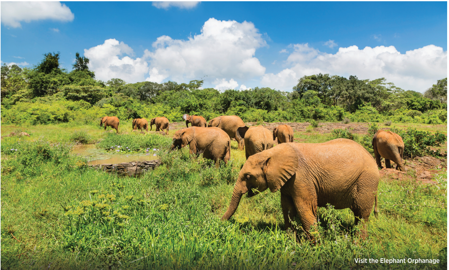
Visit the Elephant Orphanage