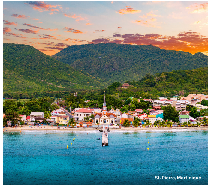
St. Pierre, Martinique

and turquoise waters. With no roads and just one small village, this hidden gem offers the perfect retreat for a day of relaxation and exploration. Take a dip in the crystal-clear Caribbean waters, snorkel among vibrant coral reefs, or simply unwind on a pristine stretch of beach with a cocktail in hand.