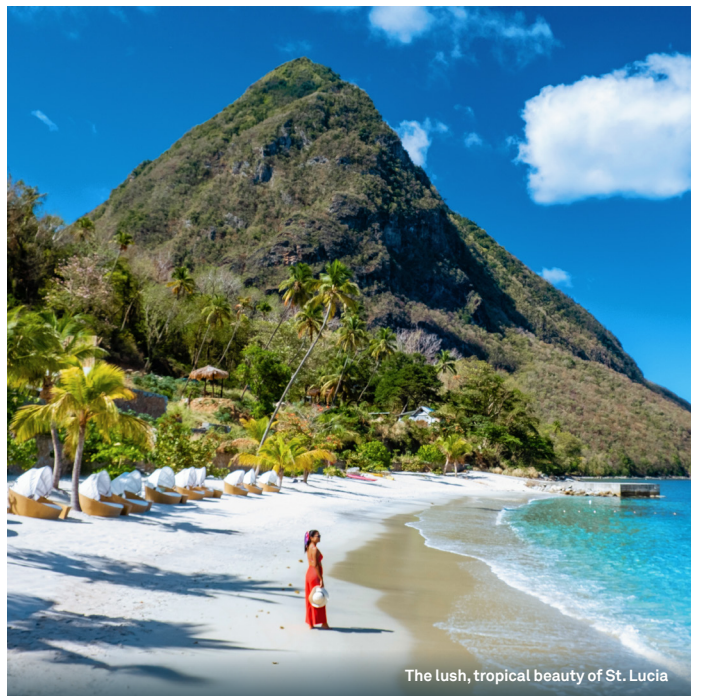
The lush, tropical beauty of St. Lucia

The itinerary is a guide only and may be amended for operational reasons. As such Mayflower & Scenic cannot guarantee the tour will operate unaltered from the itinerary stated above. Please refer to our terms and conditions for further information. #Spa treatments at additional cost. +All drinks on board, including those stocked in your mini bar, are included, except for a very small number of rare, fine and vintage wines, Champagnes and spirits. Specialty restaurants require a reservation, enquire on board. ^Flights on board our two helicopters are at additional cost, subject to regulatory approval, availability, weight restrictions, medical approval and weather conditions. Submersible not operational on this departure.