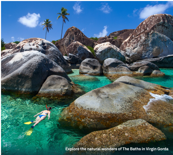
Explore the natural wonders of The Baths in Virgin Gorda