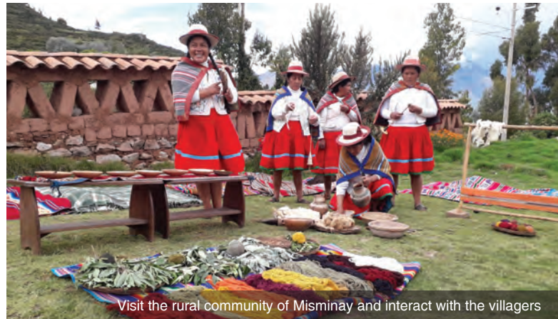
Visit the rural community of Misminay and interact with the villagers

DAY 1 Depart the USA: Depart the USA on a flight to Lima, Peru. With a late evening arrival, the Mayflower Cruises & Tours representative will meet you at the airport and walk you across the street to the hotel.