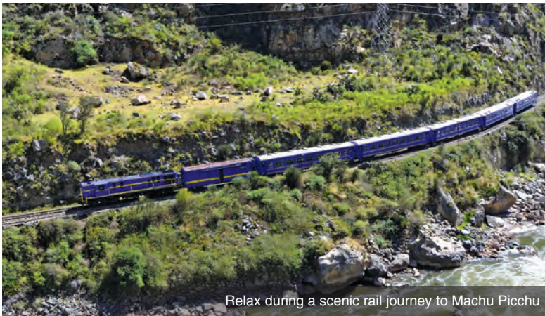
Relax during a scenic rail journey to Machu Picchu

The entire valley is filled with architectural wonders around every vista! Continue to Sacsayhuaman, a gigantic walled city and monumental former royal fortress. This former ceremonial compound is a magnificent example of Inca military power and boasts an amazing panoramic view of Cusco. After the excursion, the afternoon is at leisure before an included dinner with entertainment at a local restaurant. Meals: B, D