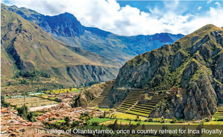
The village of Ollantaytambo, once a country retreat for Inca Royalty