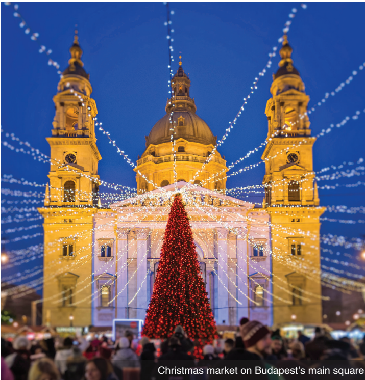
Christmas market on Budapest's main square