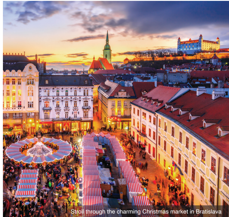
Stroll through the charming Christmas market in Bratislava

DAY 1 Depart the USA: Depart the USA on your overnight flight to Budapest, Hungary.