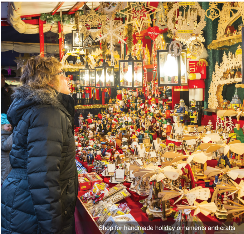
Shop for handmade holiday ornaments and crafts

Christmas time memories of this old Austrian town. Meals: B, L, D DiscoverMORE: Full day Excursion to Salzburg (additional expense)