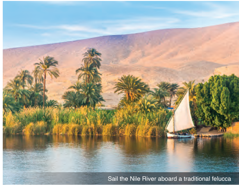
Sail the Nile River aboard a traditional felucca

DAY 1 Depart the USA: Depart the USA on your transatlantic overnight flight to Cairo, Egypt.