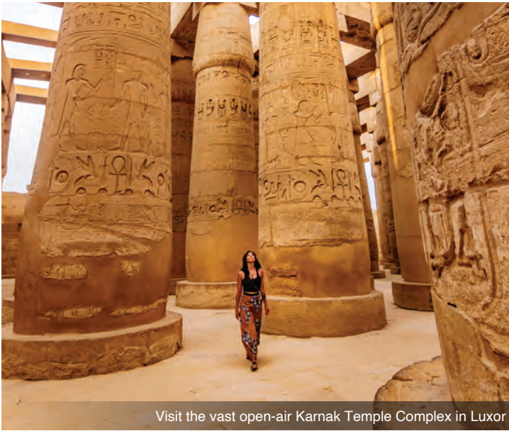
Visit the vast open-air Karnak Temple Complex in Luxor