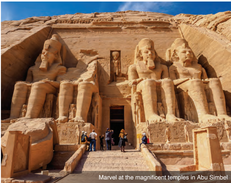
Marvel at the magnificent temples in Abu Simbel

Egypt, but it is the second largest after Karnak. In the afternoon, sail to Kom Ombo, a pleasant agricultural town and home to many Nubians. Enjoy a cooking class onboard as you sail to the next port. Upon arrival, visit the unusual Temple of Kom Ombo dedicated to both Horus and the crocodile god Sobek. After re-embarking, the ship sails for Aswan. Relax on the Sun Deck as you cruise along the Nile. Meals: B, L, D