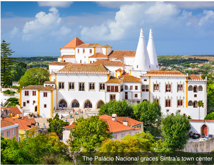
The Palácio Nacional graces Sintra's town center