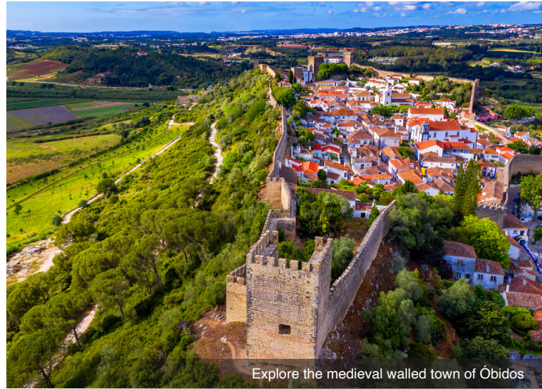
Explore the medieval walled town of Óbidos

DAY 1 Depart the USA: Depart the USA on your overnight flight to Lisbon, Portugal.