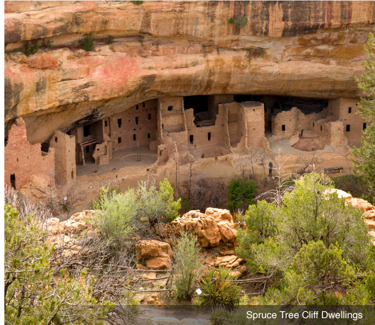
Spruce Tree Cliff Dwellings