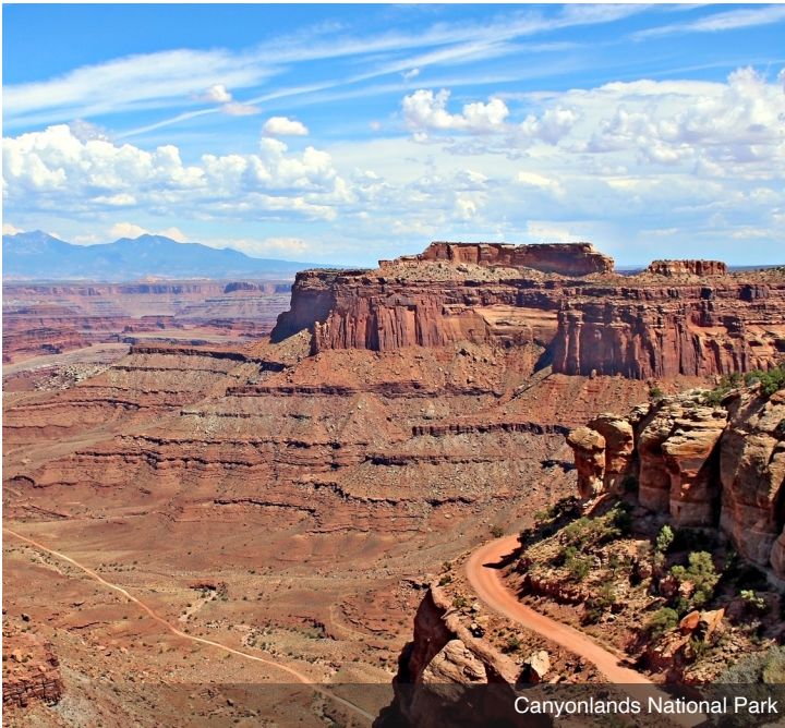
Canyonlands National Park