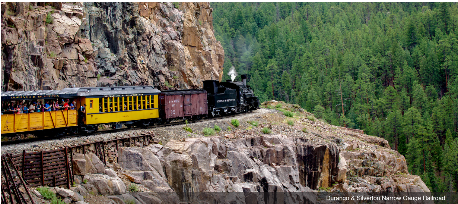
Durango & Silverton Narrow Gauge Railroad

San Juan National Forest. The locomotives used today remain 100% coal-fired, steam-operated and are maintained in their original condition. Meal: B