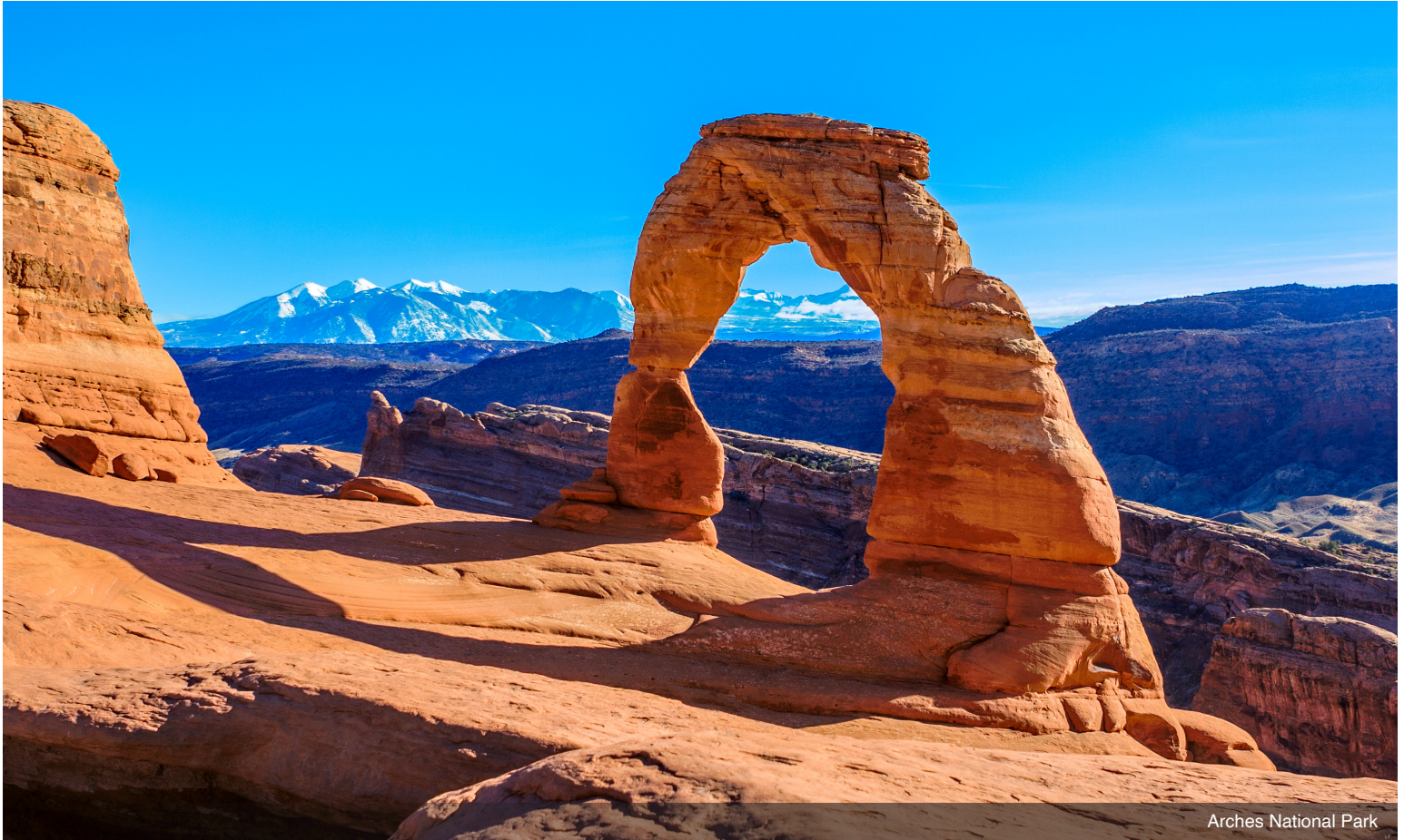
Arches National Park