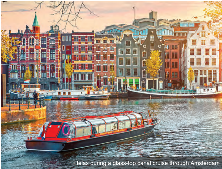
Relax during a glass-top canal cruise through Amsterdam

DAY 10 Koblenz: Begin the day sailing through the spectacular UNESCO World Heritage Rhine Gorge. Pass countless medieval castles and vineyards lining the shores of this section of the river, with photo opportunities around every bend. See the infamous Lorelei statue and Pfalzgrafenstein Castle, built on an island in the middle of the river as a medieval toll station. Continue cruising to the 2000-year-old town of Koblenz, situated at the confluence of the Rhine and Moselle Rivers. Enjoy a walking tour through the streets of the city as your guide points out historic monuments and buildings. See the 'German Corner' monument marking the confluence of the Rhine and Moselle Rivers. Panoramic views await from the visit to Ehrenbreitstein Fortress, reached by cable car, crossing the river! This evening, attend a private concert as part of the EmeraldPLUS program. Meals: B, L, D