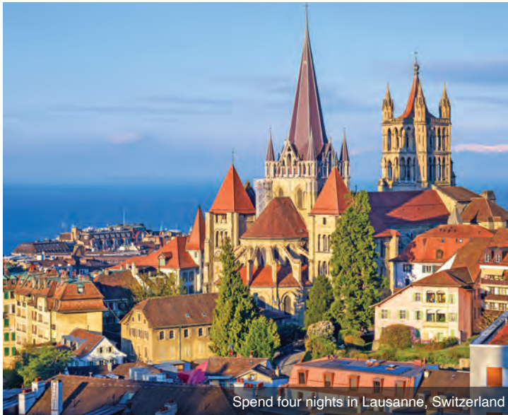
Spend four nights in Lausanne, Switzerland