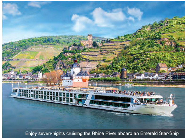
Enjoy seven-nights cruising the Rhine River aboard an Emerald Star-Ship

DAY 1 Depart the USA: Depart the USA on your overnight flight to Geneva, Switzerland.