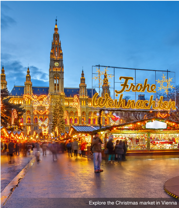
Explore the Christmas market in Vienna