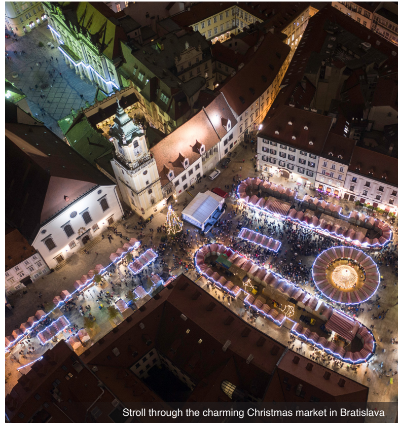
Stroll through the charming Christmas market in Bratislava

DAY 1 Depart the USA: Depart the USA on your overnight flight to Vienna, Austria.