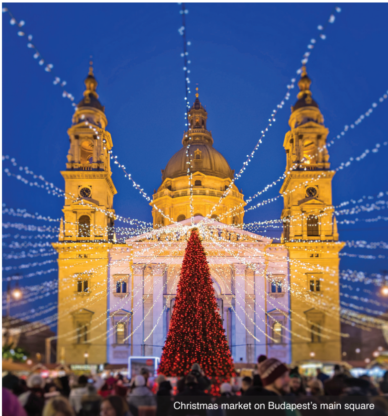
Christmas market on Budapest's main square

There is so much to take in while you pass through the bustling city, which is an attractive destination for visitors from all over the world. During your free time, stroll the Christmas market on Budapest's main square near Váci Utca Street, which showcases Hungarian craft products such as glass blowing, knitting, wood carving, candle making, pottery, leather trade, traditional Hungarian embroidery and lace work, etc.