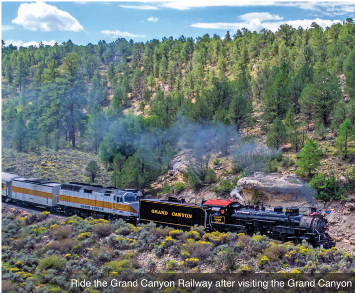
Ride the Grand Canyon Railway after visiting the Grand Canyon

Today has been reserved as a day of leisure. Sit back, relax and enjoy the warmth of the Arizona sun, explore the eclectic art galleries and craft shops, or take an optional guided jeep tour through the Sedona backcountry. Meal: B