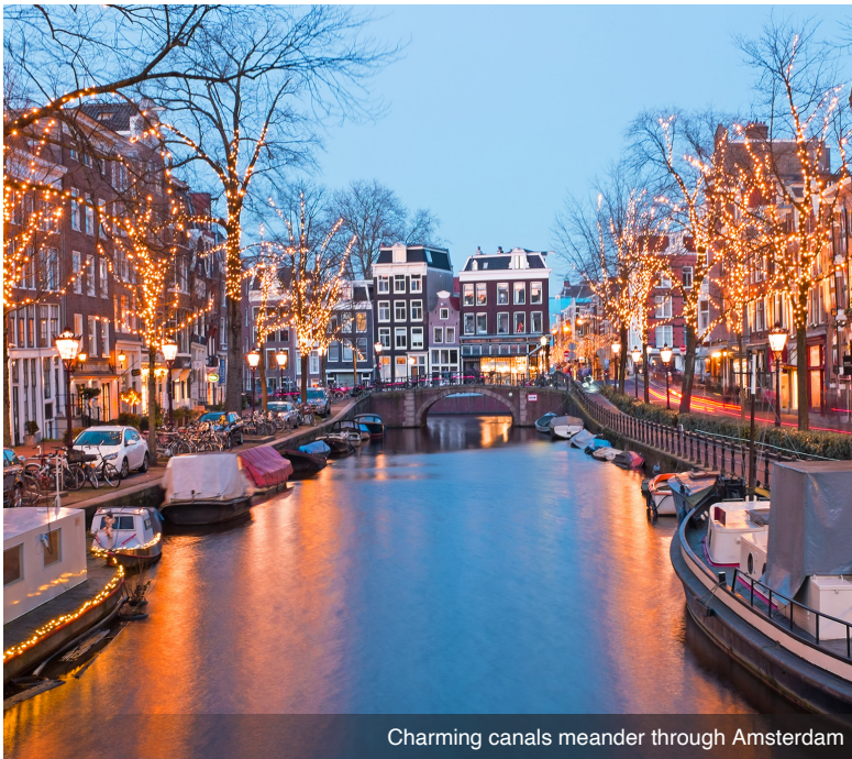
Charming canals meander through Amsterdam

EmeraldPLUS: Christmas traditions in Europe lecture onboard by the Cruise Director