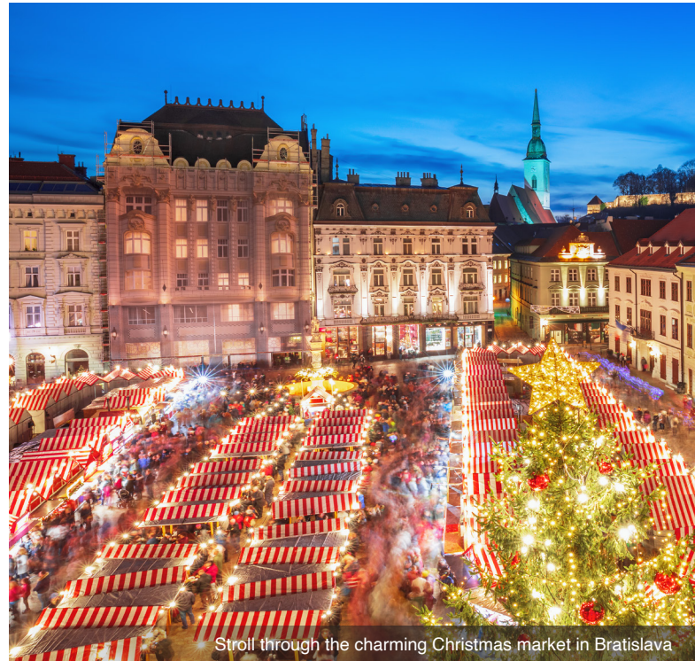
Stroll through the charming Christmas market in Bratislava

DAY 1 Depart the USA: Depart the USA on your overnight flight to Budapest, Hungary.