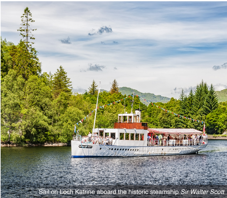
Sail on Loch Katrine aboard the historic steamship Sir Walter Scott