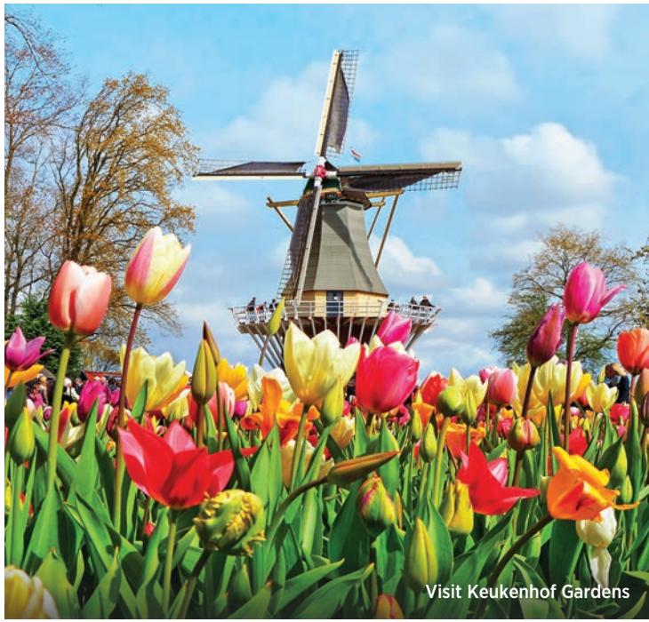
Visit Keukenhof Gardens

Middle Ages and one of the oldest build-ings in Belgium. Afterwards, enjoy free time to explore Antwerp at your leisure. Meals: B, L, D